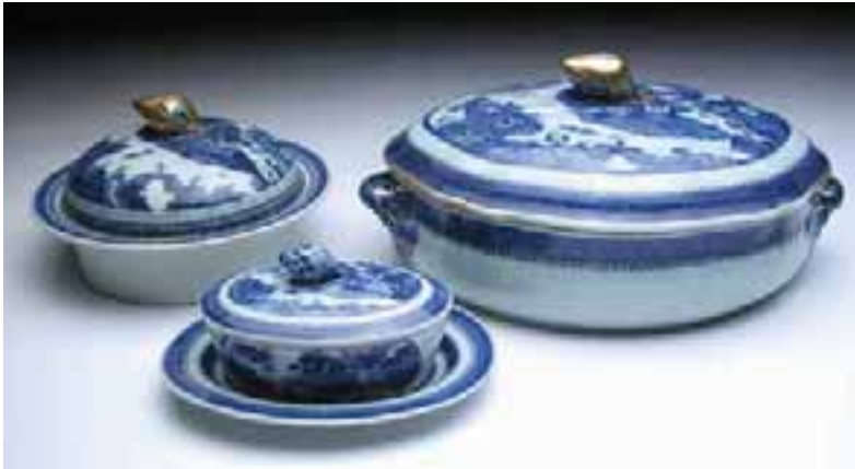
318. CHINESE EXPORT NANKING PORCELAIN OVAL MINIATURE COVERED SAUCE TUREEN, 19 th Century, with acorn finial. Width 7 in.