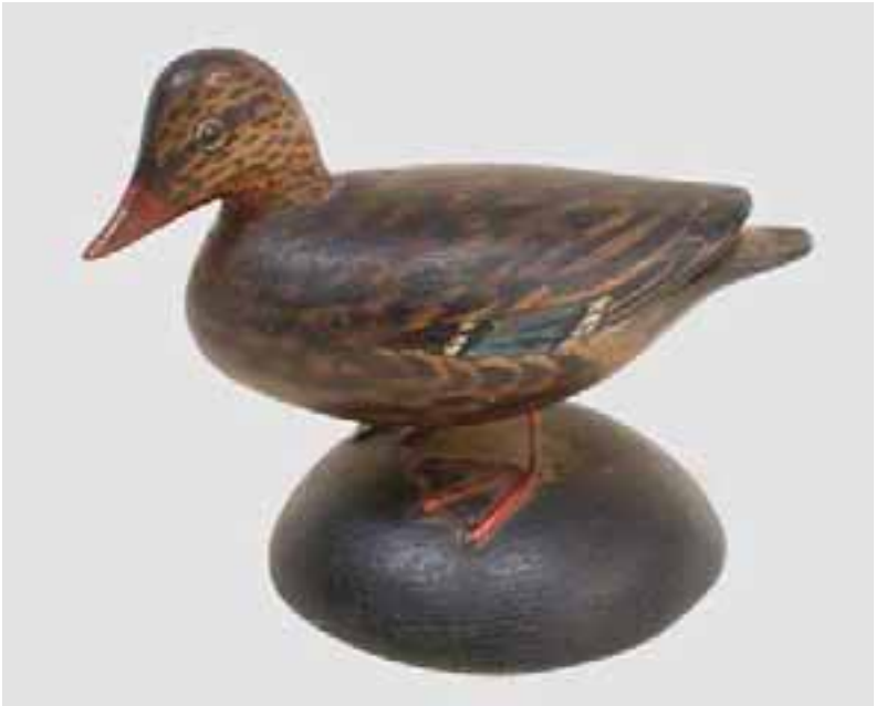
418. A. ELMER CROWELL (1862-1952) CARVED AND PAINTED MINIATURE HEN DUCK, AE Crowell Maker, East Harwich, Mass. Height Approximately 3 in.