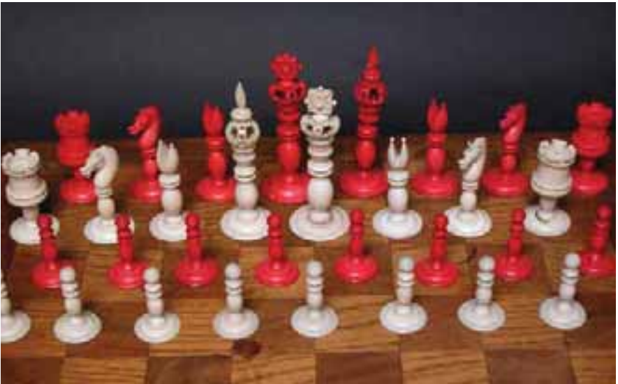
283. CARVED AND PIERCED IVORY CHESS SET, early 19 th Century , with inlaid playing board. King Height: 3 \frac{3}{4} in.