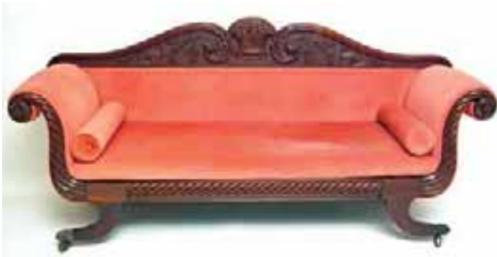
303. AMERICAN FEDERAL UPHOLSTERED SOFA , first quarter of the 19 th Century, attributed to Samuel McIntire, carved of mahogany with cast brass paw casters. Length 80 in.

Basil Besler, a pharmacist and botanist, spent 16 years working on Hortus Eystettensis , which records the variety of plant species in the gardens surrounding Prince Bishop Johann Konrad von Gimmingen’s castle near Nuremberg, Germany. This garden included flora native to Germany alongside imports from all over Europe, Africa, Asia and the Americas. The book included over 300 life size engravings of plant species in the order which they bloom throughout the year.