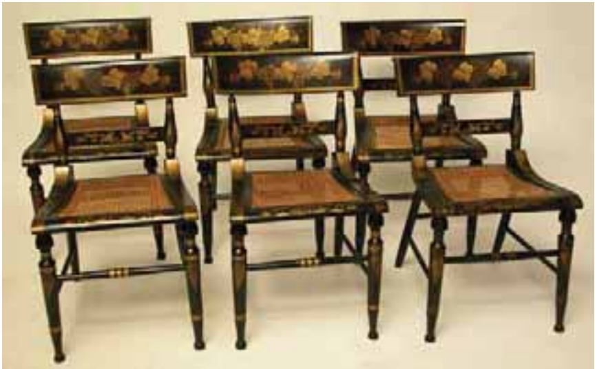
281. SET OF SIX BALTIMORE PAINT DECORATED DINING CHAIRS, circa 1840.