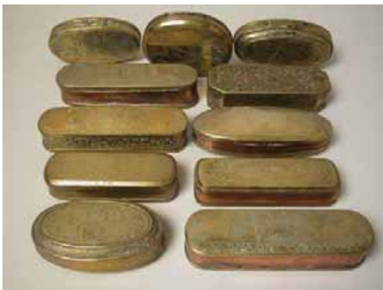
85F. COLLECTION OF 11 DUTCH ENGRAVED BRASS TOBACCO BOXES, 17th and 18th Century.