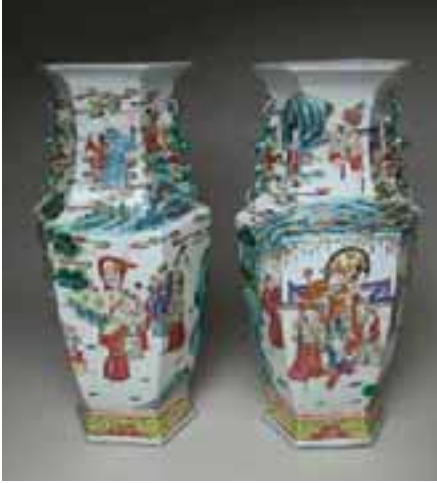
205. PAIR OF CHINESE EXPORT VASES, circa 1840. Height 17 in.