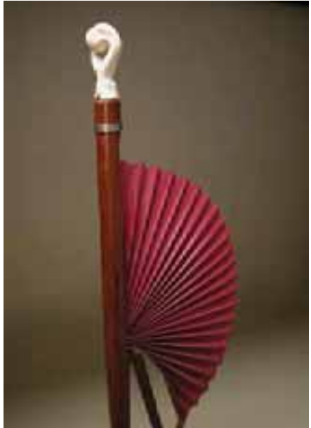
119. CARVED IVORY GADGET STICK, circa 1880 , elephant ivory hand with cufflink on shirt cuff, holding a ball on cherry shaft concealing a pleated canvas fan.