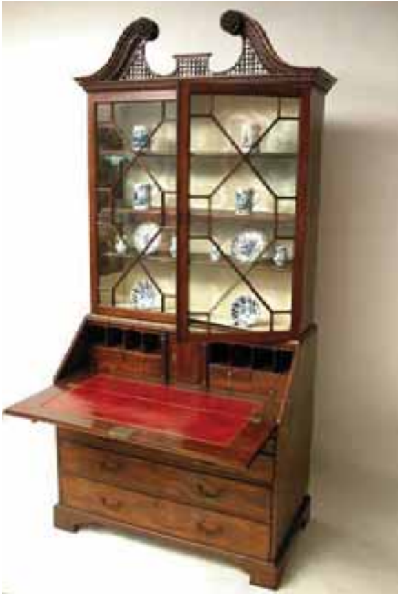
231. GEORGE III CHIPPENDALE STYLE MAHOGANY SECRETARY BOOKCASE, circa 1770, with fitted desk interior, 13 pane glazed doors, pierce carved fretwork and dental molding. Height 96 in. Width 46 ½ in. Depth 24 ½ in.