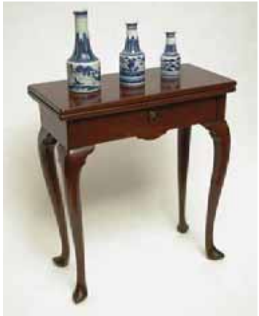
328. QUEEN ANNE ONE DRAWER SIDE TABLE, 18 th Century, with flip top leaf supported on a gate leg, one drawer frieze with cabriole legs and slipper feet. Height 28 ½ in. Width 25 in. Depth 12 ¼ in.