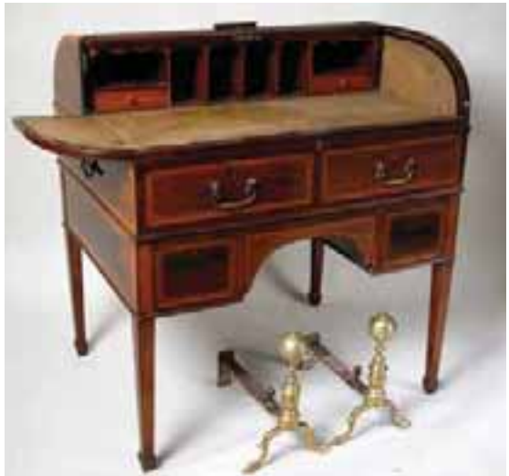
272. ENGLISH MAHOGANY TAMBOUR DESK, circa 1800 , leather satinwood interior with flip down sides and carrying handles to remove top section. Height 41 in. Width 36 in. Depth 28 in.