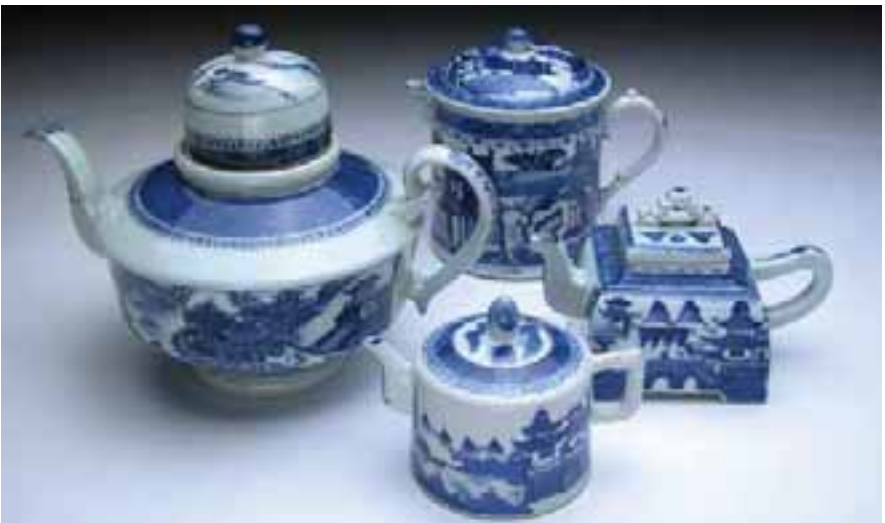
377. CHINESE EXPORT NANKING PORCELAIN CREAMER, 19 th Century, with unique applied 2 piece scroll handle. Length 6 in. Height 3 ¼ in.