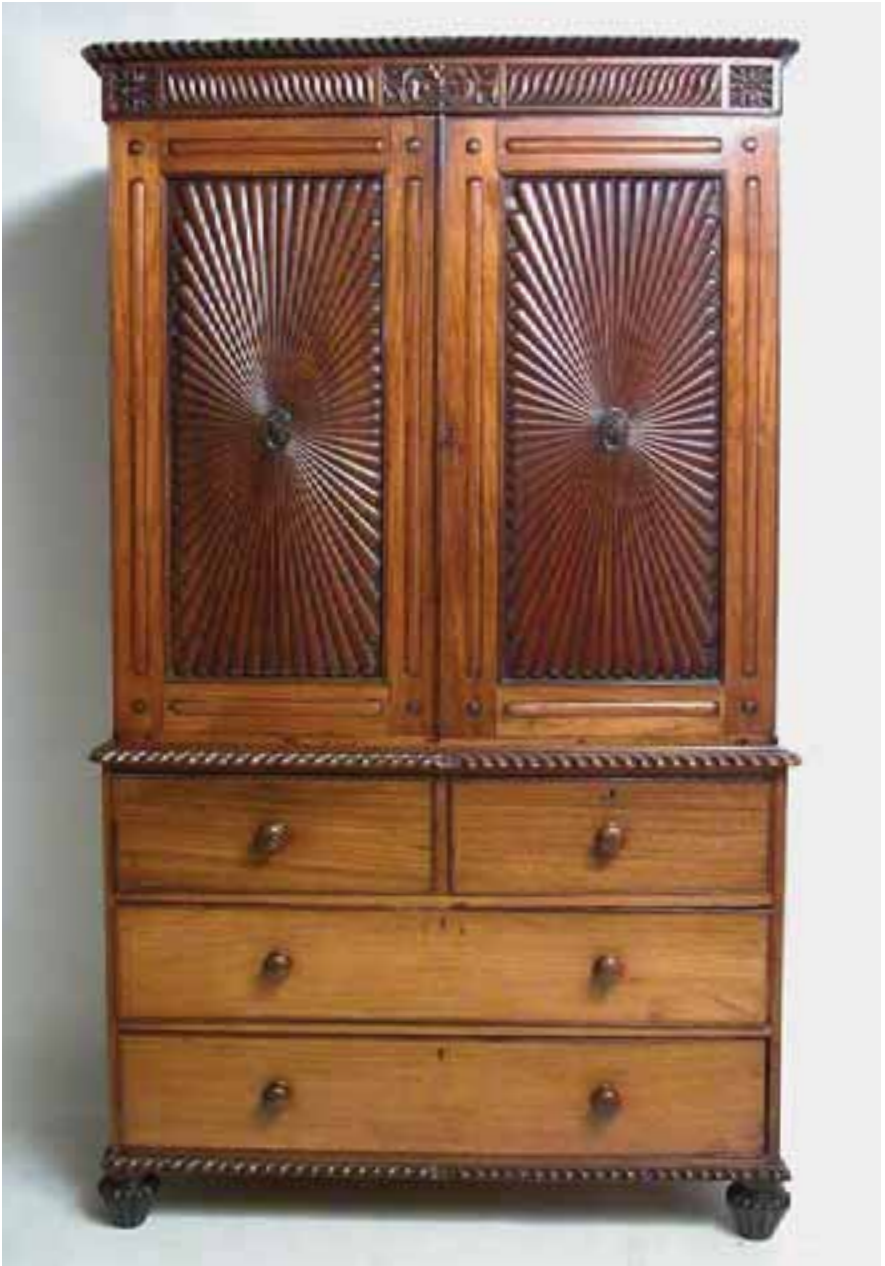
40. ANGLO-INDIAN ROSEWOOD LINEN PRESS, circa 1850 , carved gadroon, rosette and swerve crown, above sunburst doors. Lower section, two over two drawers framed within gadroon carvings on short turned feet. Height 84 in. Width 50 in. Depth 22 in.