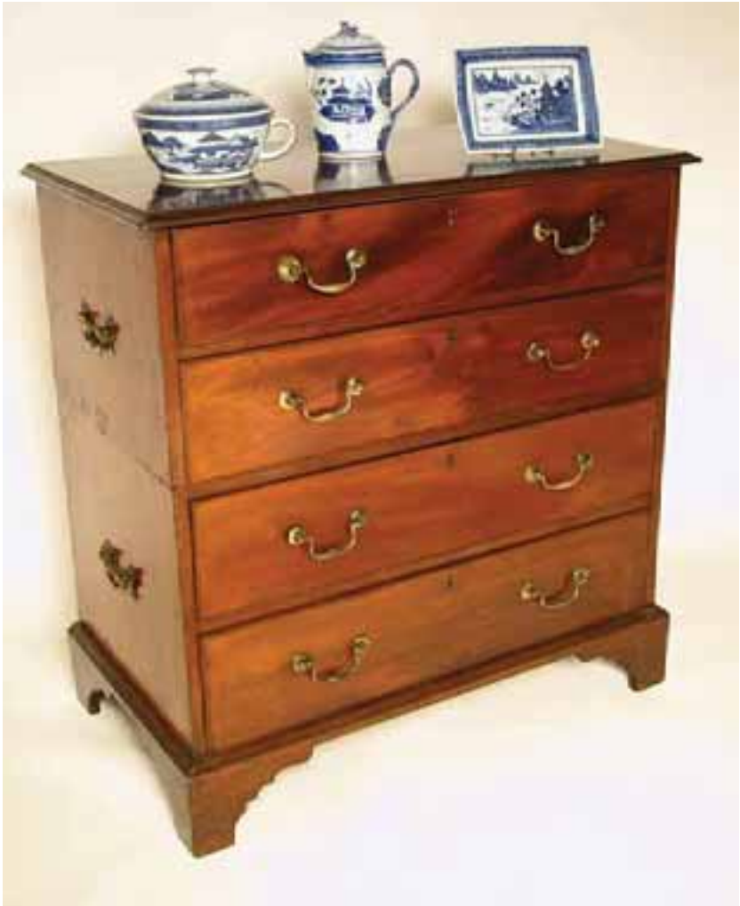
41. CHINESE EXPORT CANTON PORCELAIN CHAMBER POT, circa 1850. Diameter 8 in.