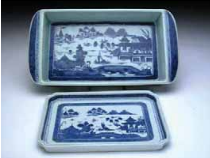
316. SCARCE CHINESE EXPORT CANTON PORCELAIN BULB FORCING TRAY, mid 19 th Century. Length 14 ½ in. Width 7 ½ in.