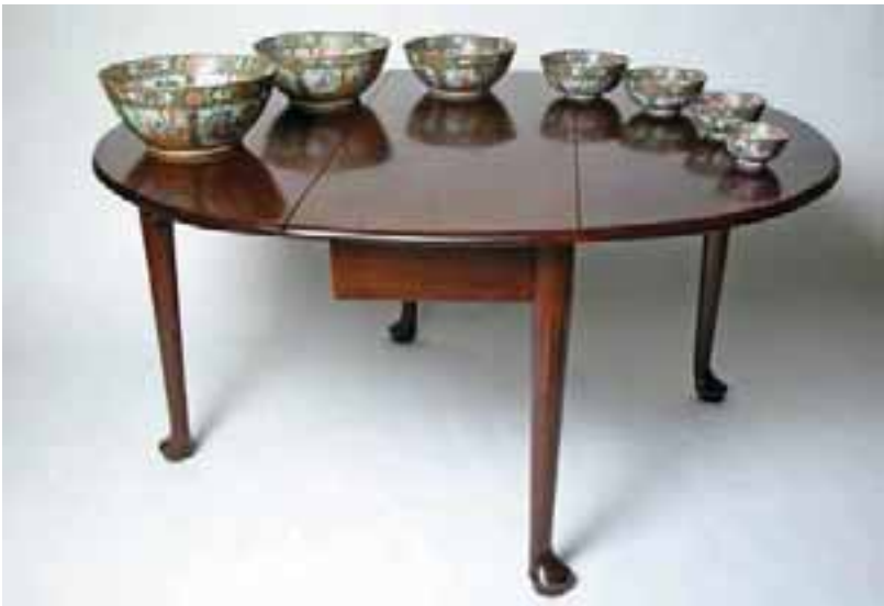
169. ASSEMBLED NEST OF SEVEN CHINESE EXPORT PORCELAIN ROSE MEDALLION BOWLS, mid 19 th Century, made for the Boston Market. Diameters 13 ¼ in. to 4 ¾ in.