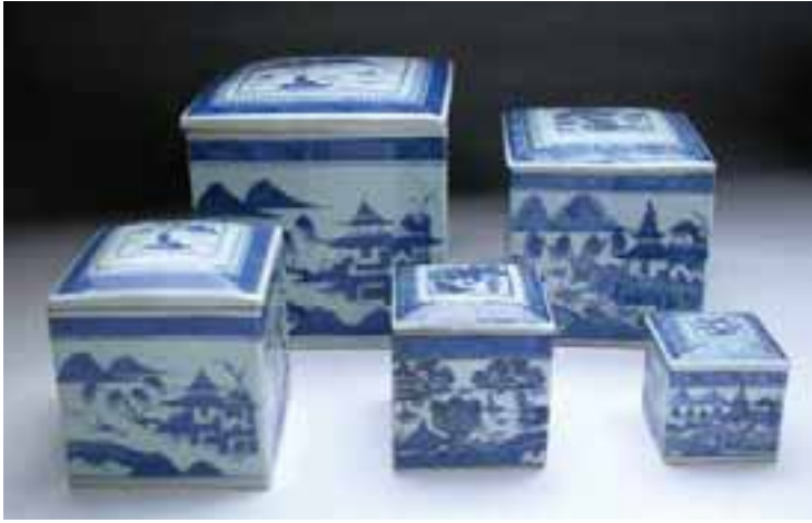
192. RARE LARGE CHINESE EXPORT CANTON PORCELAIN COVERED BOX, circa 1830. Height 7 ½ in.