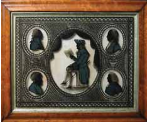
274. EGLOMISE PORTRAITS “ General Oglethorpe, Washington, Aaron Burr, Benj. Franklin, and William Penn, ” early 19 th Century. 12 in. x 15 in.