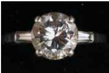
293. DIAMOND SOLITAIRE RING platinum ring with one round diamond approximately 1.4cts and 2 baguette diamonds approximately .25cts.