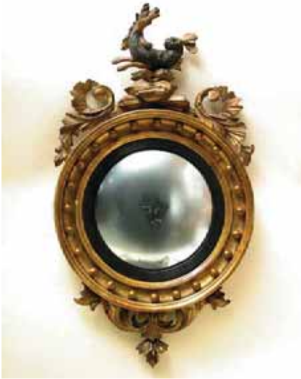
126. UNUSUALLY PETITE GILT CONVEX MIRROR, circa 1820, with surmounted Hippocampi. Height 28 in. Width 15 in.