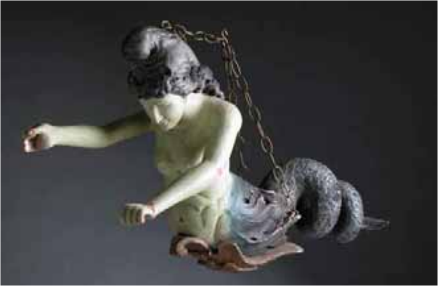
337. FINELY CARVED AND POLYCHROMED HANGING MERMAID SCULPTURE. Length 37 ½ in.