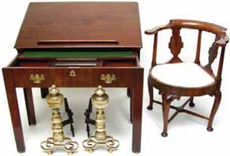
82. GEORGIAN MAHOGANY GENTLEMAN'S ARCHITECT'S TABLE, circa 1800 , inclining top with pull out drawer and legs exposing compartments, adjusting mirror, and sliding felt work surface. Height 28 ½ in. Width 38 in. Depth 23 ½ in.