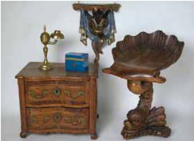
180. ITALIAN BLACKAMOOR BRACKET , circa 1880, figure emerging from curtains supporting a gilt shelf. Height 17 in.