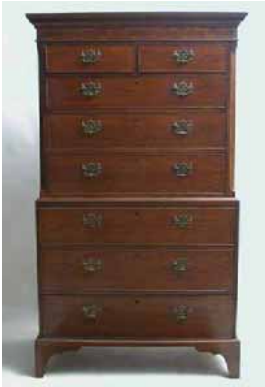
292. ENGLISH MAHOAGANY CHEST ON CHEST, circa 1800 , dental carved crown molding above inlaid frieze, two over three graduating drawers, lower section of three deep drawers, with Birmingham brasses, on straight bracket feet. Height 75 ½ in. Width 44 in. Depth 22 in.