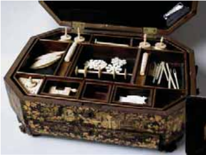
249. CHINESE EXPORT LACQUER SEWING BOX, circa 1830, hinged top exposing carved bone fittings and compartment, removable tray, lower drawer and side handles. Height 6 ½ in. Width 13 ½ in. Depth 9 ¾ in.