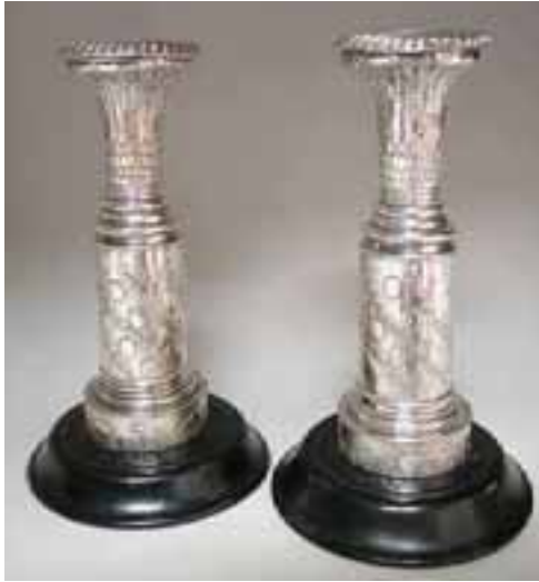
342. PAIR OF ANTIQUE SILVER PLATED CANDLESTICKS , commemorating English maritime victories: Nelson - The Battle of the Nile (also known as the Battle of Aboukir Bay); Jervis - In the Battle of Cape St. Vincent (14 February 1797); Howe - The Atlantic Campaign of May 1794; Duncan - The Battle of Camperdown, (11 October 1797). Height 8 ¼ in.