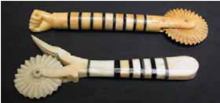
127. WHALE IVORY PIE CRIMPER, circa 1830, clenched fist opposing zigzag wheel with eight baleen spacers. Length 7 ½ in.