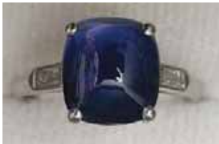
294. CABOCHON SAPPHIRE AND DIAMOND RING platinum mounting, sapphire approximately 3.80cts and two baguette diamonds approximately .30cts.