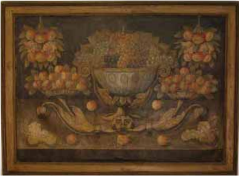
179. FRENCH SCHOOL “ Fruit Still Life ,” 17 th Century , oil on canvas, with plums, grapes, apples and bowl in stylized motif; with old Parke-Bernet Galleries and Property of T. Gilbert Brouillette NY labels on verso. 30 in. x 41 in.