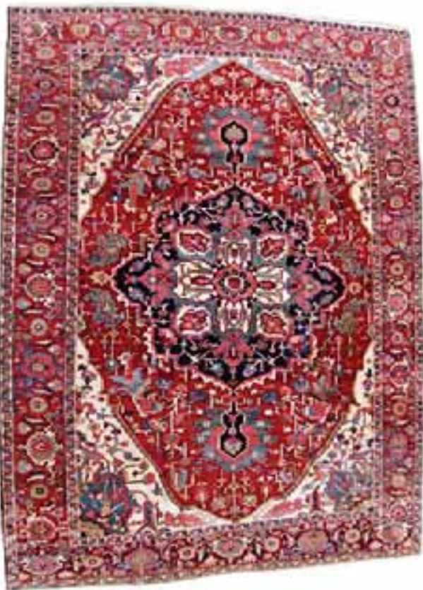
39. ANTIQUE SERAPI CARPET, circa 1890-1910. 9.6 x 12.9