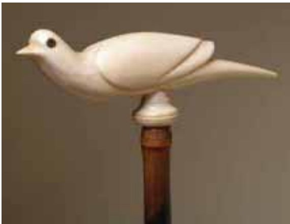
207. CARVED NANTUCKET WHALE IVORY DOVE CANE, circa 1870, perched dove with inlaid eye on a bamboo shaft.