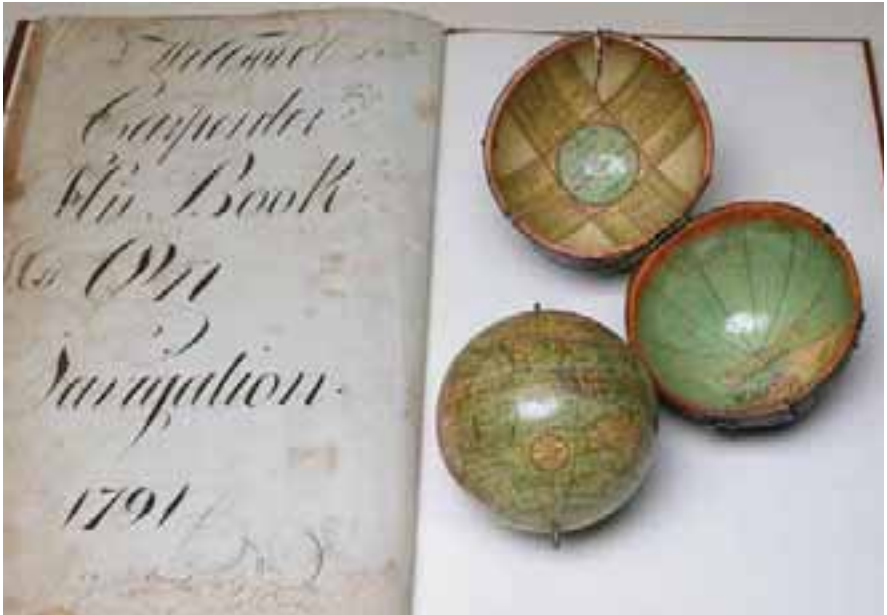
332. WILLIAM CARPENTER HIS BOOK ON NAVIGATION, 1791 , with many illustrations and charts.