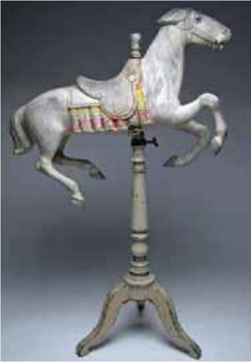
203. CONEY ISLAND BOARDWALK PHOTOGRAPHER'S HORSE PROP, turn of the Century, in original paint, on original stand. Height 47 in. Width 29 in.