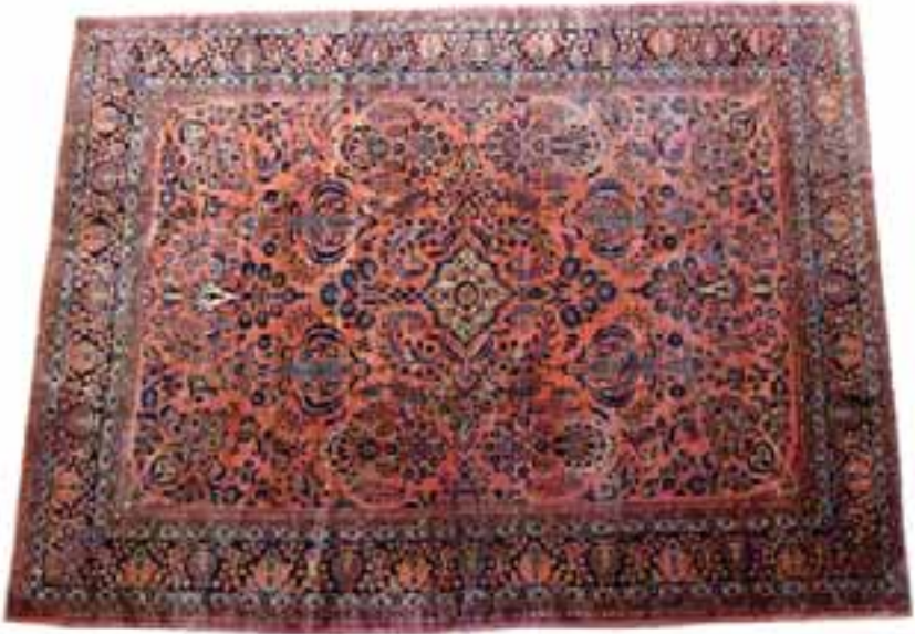
290. HAND WOVEN SAROUK CARPET, circa 1930. 10.4 x 13.10