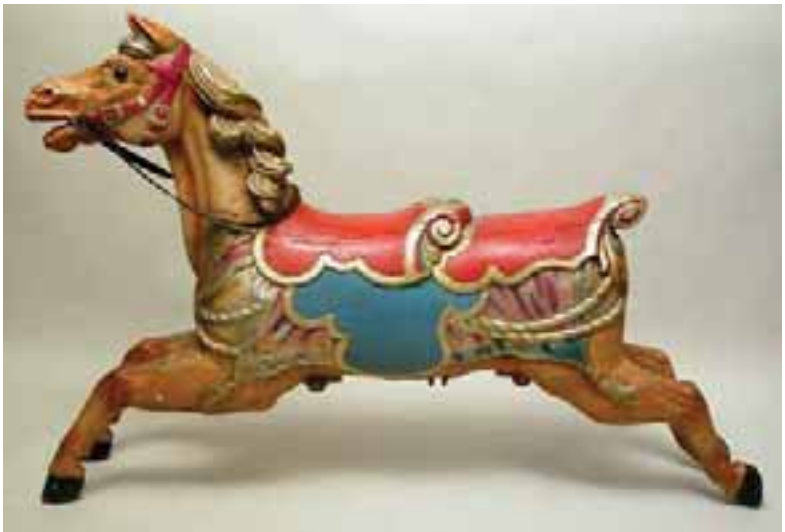
204. CARVED CAROUSEL HORSE BY ORTON & SPOONER, BURTON-ON-TRENT, DERBYSHIRE, ENGLAND circa 1915, leaping posture with tasseled blanket and double saddles. Height 44 in. Length 66 ½ in. Provenance: Jack Palance Collection to present owner.