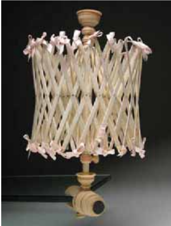
139. NANTUCKET WHALE IVORY AND WHALEBONE SWIFT, circa 1850, whale ivory turned clamp, cups and threaded support with red wax scribe lines, whalebone shaft with 98 ribs. Height 15 in.