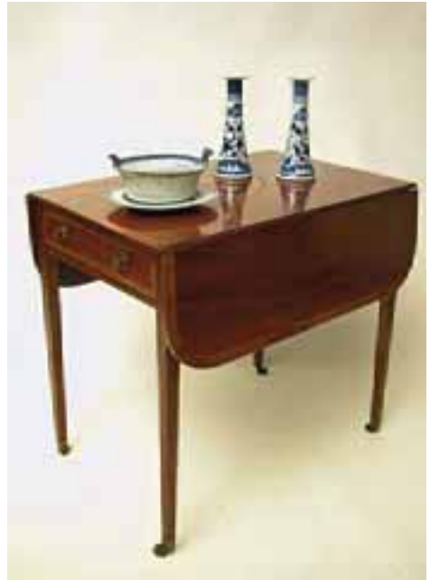
10. CHINESE EXPORT CANTON PORCELAIN CHESTNUT BASKET AND UNDERPLATE, circa 1830. Length 8 ½ in.