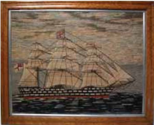
212. ENGLISH SAILOR MADE WOOLIE circa 1850 , portrait of a British Man-O-War in bird's maple frame. 15 in. x 20 in.