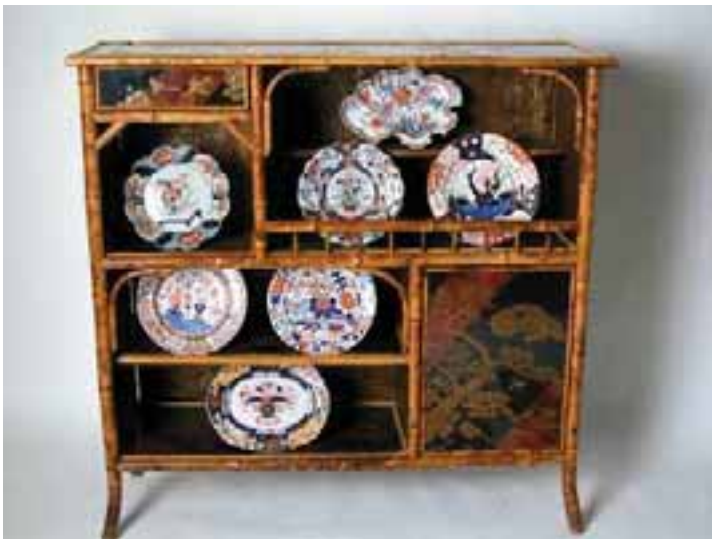
90. ENGLISH CHINOISSERIE BAMBOO AND LACQUER BOOKCASE CABINET, circa 1880, with bird and floral decoration. Height 42 in. Width 42 in. Depth 14 in.