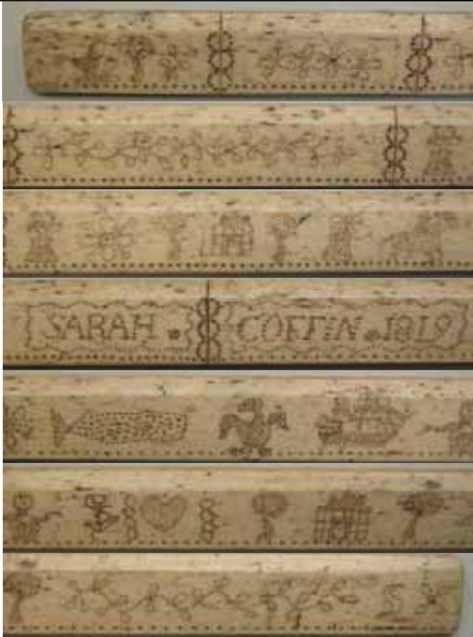
224. EXCEPTIONALLY RARE AND UNIQUE “” WHALEBONE DIP STICK – RULER, circa 1819, the length of which is covered with pin scrimshaw work of animals, houses, plants, ships, sperm whale, anchor, and heart; 28 expressions in all. Length 35 ¾ in.