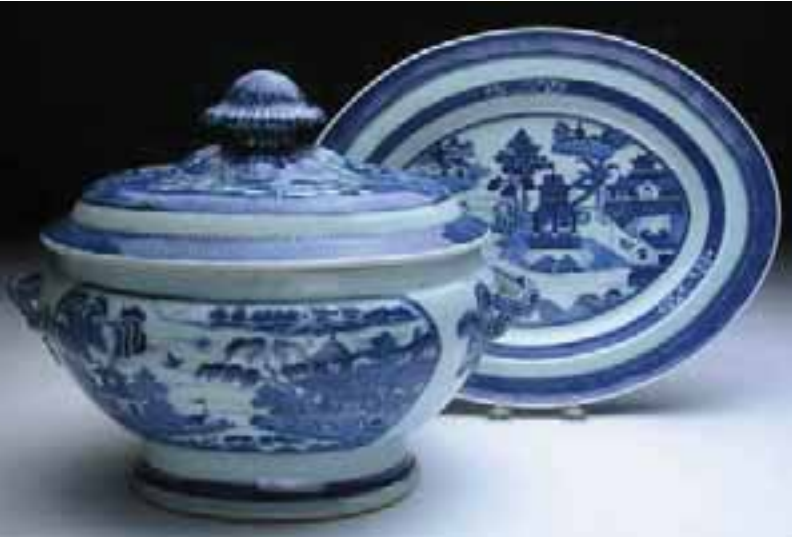
227. SCARCE LARGE CHINESE EXPORT NANKING PORCELAIN COVERED SOUP TUREEN AND UNDERPLATE, early 19 th Century, with twisted applied handles and flower blossom finial. Height 10 \frac{3}{4} in. Length 13 \frac{3}{4} in.