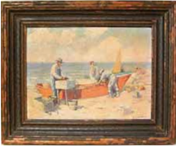
74. F.W. CHAPMAN (20 th Century) “Cleaning the Catch,” oil on artist’s board, signed lower right F.W. Chapman. 12 in. x 16 in.