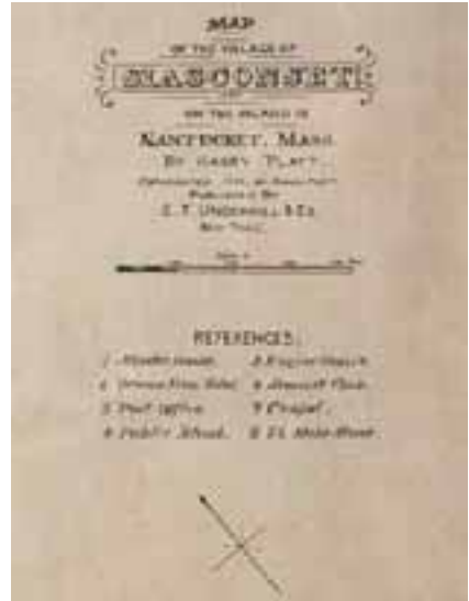
24. MAP OF THE VILLAGE OF SIASCONSET ON THE ISLAND OF NANTUCKET, MASSACHUSETTS, BY HARRY PLATT , copyrighted 1888 by Harry Platt, Published by E.T. Underhill & Co. 26 in. x 19 in.