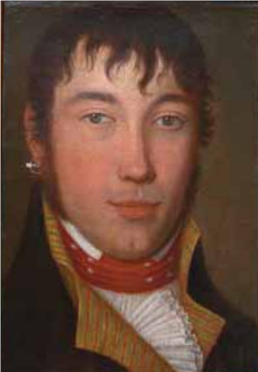
77. PORTRAIT OF A HANDSOME YOUNG SAILOR IN FORMAL WEAR AND EARRING, late 18 th Century, oil on canvas. 12 ½ in. x 9 in.