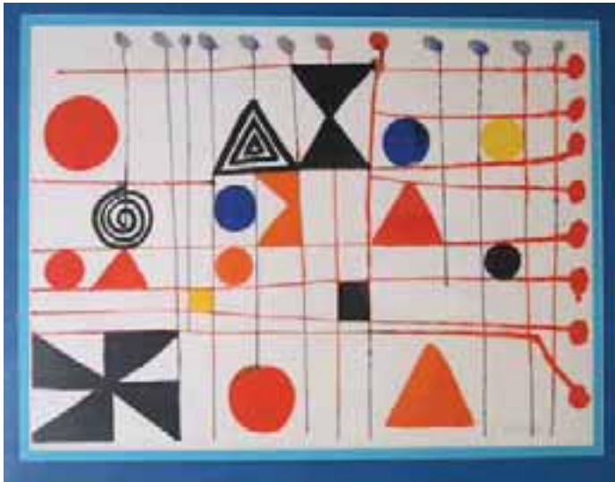
255. ALEXANDER CALDER (CONNECTICUT/ NEW YORK 1898-1976) MODERNIST LITHOGRAPH, signed in pencil lower right, Calder. 21 in. x 29 ½ in.

Alexander Calder was born in Pennsylvania to a family of artists and pursued a degree in mechanical engineering from the Stevens Institute of Technology, before turning to art. He moved to Paris in 1926 and was influenced by avant-garde artists there including Piet Mondrian, le Corbusier, Joan Miró, and Man Ray. Calder is credited with the invention of the mobile and explores movement in both his sculpture and paintings. His works can be found in the Art Institute of Chicago, the Guggenheim Museum –New York, the Museum of Modern Art, the National Gallery –Washington DC, the Tate Gallery –London, and the Museum of Contemporary Art – Barcelona, to name a few.