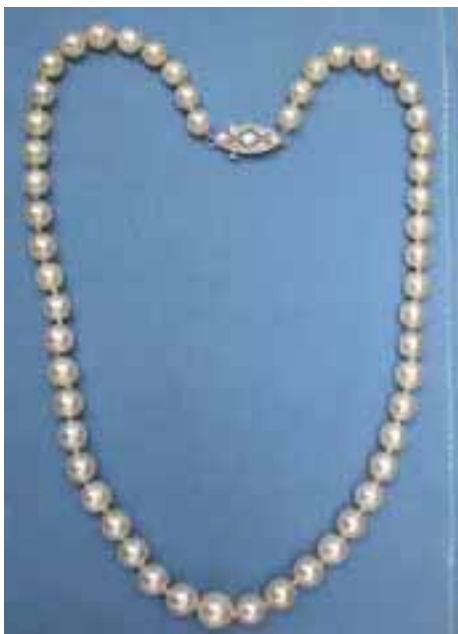
385. GRADUATED CULTURED PEARL NECKLACE with 53 pearls, 6 - 9.3mm center, with platinum and seven diamond clasp.