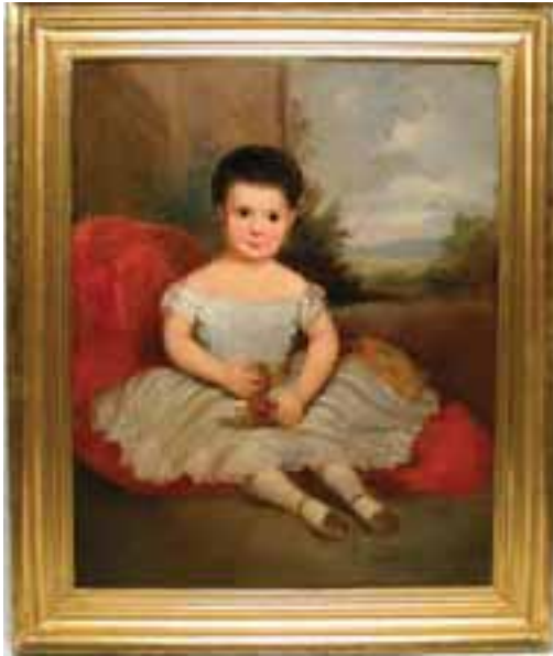
264. AMERICAN BALTIMORE SCHOOL PORTRAIT OF A YOUNG GIRL, circa 1840 , seated by a window with landscape vista, holding an apple and grapes; in period lemon gilt frame. 36 in. x 28 in.