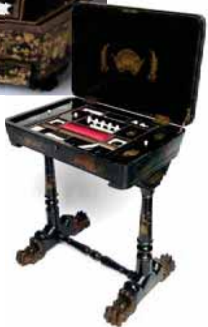
250. CHINESE EXPORT LACQUER AND CHINOISERIE DECORATED SEWING TABLE, circa 1830, with carved bone interior fittings and compartments. Height 29 ½ in. Width 24 ¾ in. Depth 16 ¾ in.