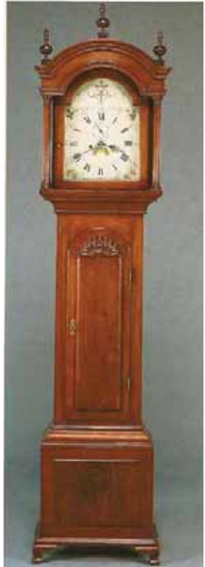
208. FINE AND RARE QUEEN ANNE BLOCK-AND-SHELL CARVED MAHOGANY TALL CASE CLOCK, GODDARD TOWNSEND SCHOOL, NEWPORT, RHODE ISLAND, circa 1785 , surmounted by three spiral and flower petal-carved spherical finials, the molded hood above an arched glazed door opening to a white-painted dial with seconds and calendar date mechanisms decorated at the top with an urn and drapery swags, the waisted case below with hinged block-and-shell carved door, the panel base on ogee bracket feet. Height 87 in. Width 17 ¼ in.

Provenance: John Walton, Inc. Jewett City, CT; Sotheby's lot #2203 January 27, 1995 to the present owner.