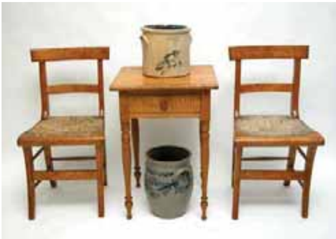
14. PAIR OF FIGURED MAPLE RUSH SEAT SIDE CHAIRS, circa 1820.