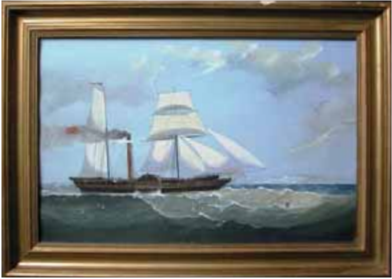
325. TEMPERA SEASCAPE OF THE STEAM SAILER “William Fawcett,” 19 th Century. 15 in. x 23 ¼ in.