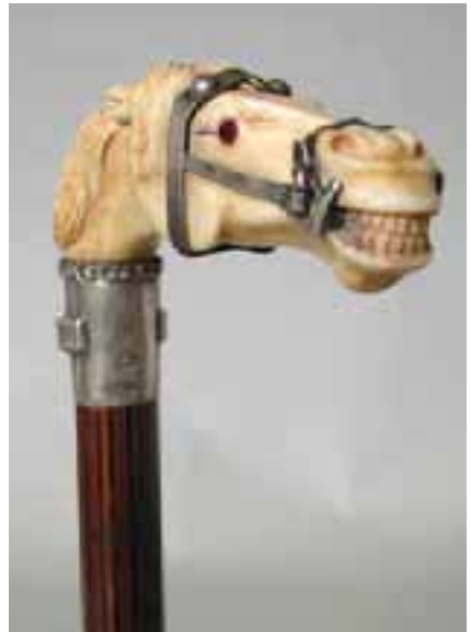
162. CARVED IVORY AND STERLING HORSE HEAD CANE, circa 1910 , racing horse with sterling silver bridle and band, on a wood shaft.