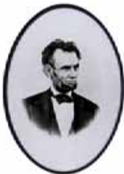
330. AMERICAN FOLK ART CARVING OF ABRAHAM LINCOLN, late 19 th Century. Height 24 ½ in.