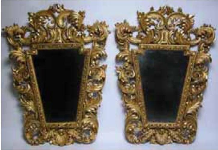
240. PAIR OF FANTASTIC LARGE CARVED AND GILT MIRRORS, circa 1820 , carved fruit keystone mirror surrounded by robust and deep foliate scrolls and a shell drop pediment. Height 52 ½ in. Width 36 in. Provenance: The Billings Estate (Union Carbide) Montecito, California to present owner.