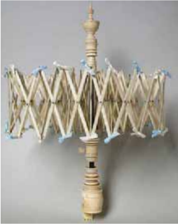
211. WHALE IVORY AND WHALEBONE SWIFT, circa 1830 , ivory barrel clamp, rings, cup and finial, bone shaft and ribs. Height 20 in.