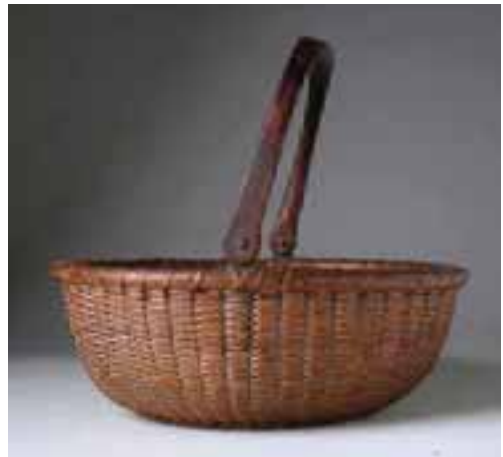
70. CARVED “JACK TAR” CHANDLERY STORE FRONT FIGURE, 19 th Century, holding a bosun’s whistle and ivory knob walking stick, standing on a later “Chandler” painted plinth. Height 55 in.