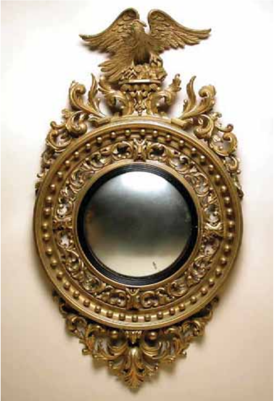
142. FINELY CARVED AND GILT CONVEX MIRROR, circa 1800 , with unusual elaborate cut-out surround and 45 spherules, reeded ebonized liner and surmounted carved eagle. Height 54 in. Width 29 ½ in.