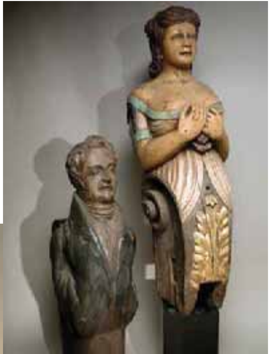
340. CARVED FIGUREHEAD of “LADY ROSE”, 19 th Century, original painted surface. Height 43 in.