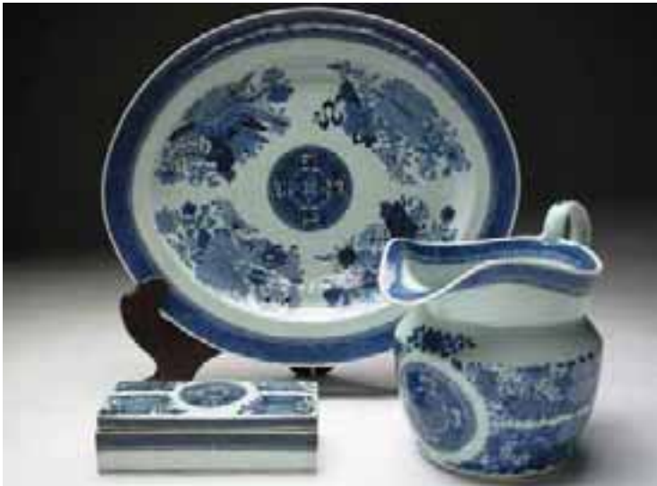
228. FITZHUGH EXPORT PORCELAIN COVERED TOILETRY BOX, circa 1810. Length 7 \frac{1}{2} in. Depth 3 \frac{1}{2} in.