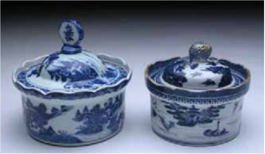
321. RARE CHINESE EXPORT CANTON PORCELAIN COVERED SUGAR BOWL, circa 1780, with shaped rim and wafer grip finial. Height 3 in. Diameter 6 in.