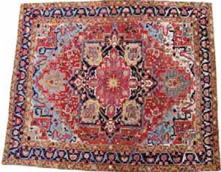
93. HANDMADE HERIZ CARPET, circa 1910. 11.3 x 9.6