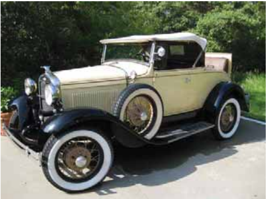
259. 1931 FORD MODEL A RUMBLE SEAT ROADSTER with convertible top