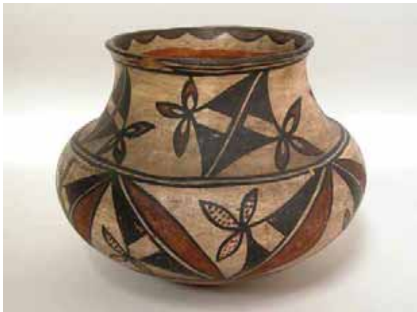
300. SAN ILDEFONSO PUEBLO AMERICAN INDIAN DECORATED POT, last quarter of the 19 th Century. Height 10 ½ in.