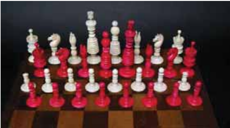
112. CARVED IVORY CHESS SET, early 19 th Century , with inlaid playing board. King Height 5 in.