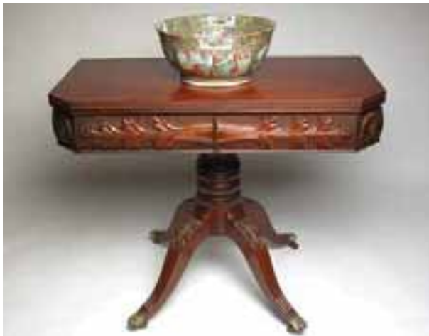
265. SCARCE CHINESE EXPORT ROSE MEDALLION OVAL FOOTED BOWL, 19 th Century , rare form. Diameter 13 ½ in. Height 6 ¼ in.