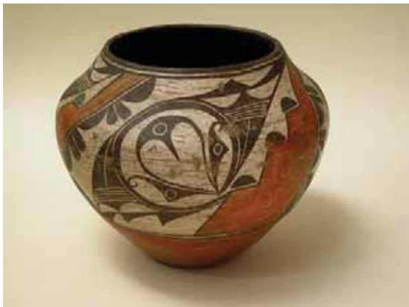
301. ZIA POT, circa 1920. Height 9 in. Width 11 in.