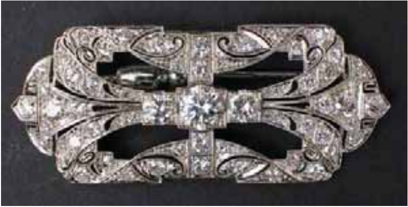
102. ART DECO PLATINUM AND DIAMOND BROOCH , center stone 6mm weighing approximately .86cts flanked by two .28ct stones, approximately 61 diamonds weighing around 3.02cts total.