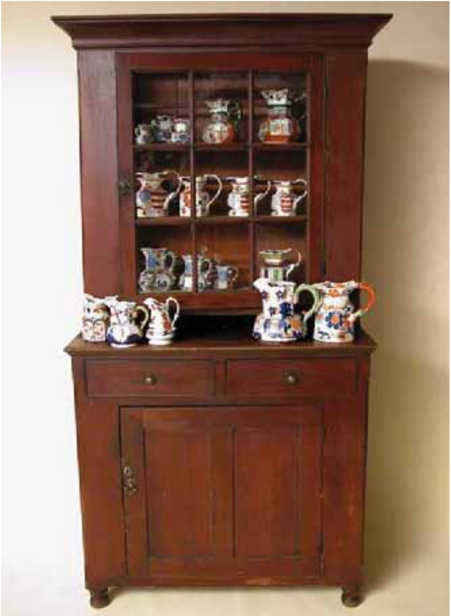
267. PENNSYLVANIA RED PAINTED HUTCH CABINET, 18 th Century , upper glazed single door over two drawers and single paneled door on turned feet. Height 84 in. Width 42 ½ in. Depth 19 in.