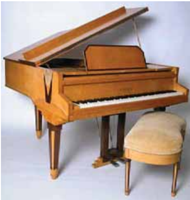
241. ART DECO MAPLE AND TIGER MAPLE BABY GRAND PIANO and matching stool, manufactured by George Rogers & Sons, London, established 1843; 107 keys. Length 54 in. Width 55 ½ in.