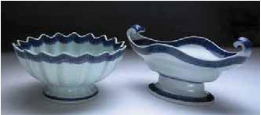
196. RARE CHINESE EXPORT NANKING PORCELAIN SCALLOPED EDGE FOOTED BOWL, early 19 th Century. Height 5 in. Diameter 10 ¼ in.