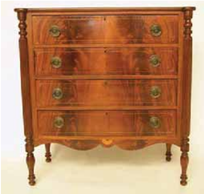
270. AMERICAN SHERATON MAHOGANY CHEST OF DRAWERS, circa 1820, line and quarter fan inlaid drawers with half fan inlaid apron, turned and ¾ outset reeded columns. Height 43 in. Width 41 in. Depth 19 ½ in