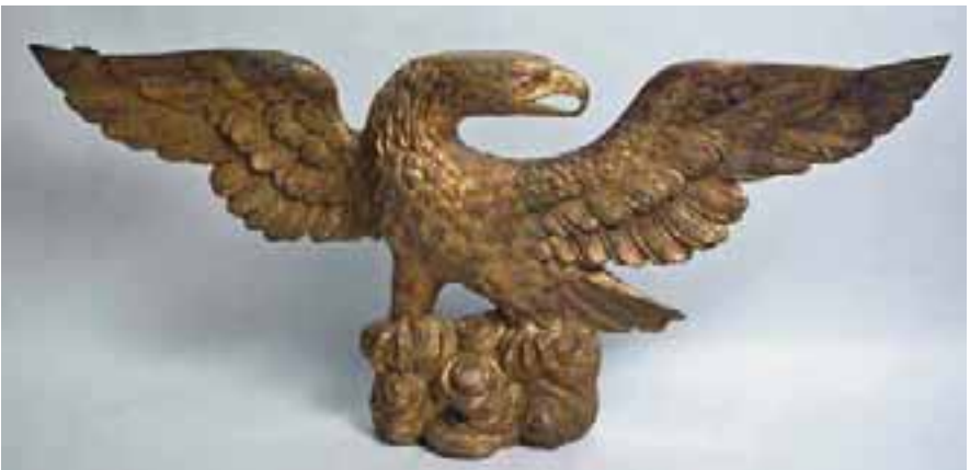
148. AMERICAN CAST IRON FEDERAL GILT ARCHITECTURAL EAGLE, 19 th Century , possibly from an armory. Height 30 ½ in. Width 67 ¼ in.