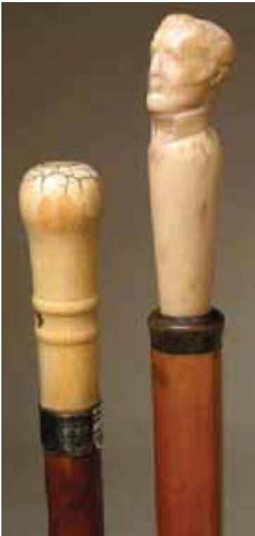
275. WHALE IVORY WALKING STICK, circa 1780, turned knob and double ring grip with engraved and scalloped silver band, initialed S.H. on a wood shaft.