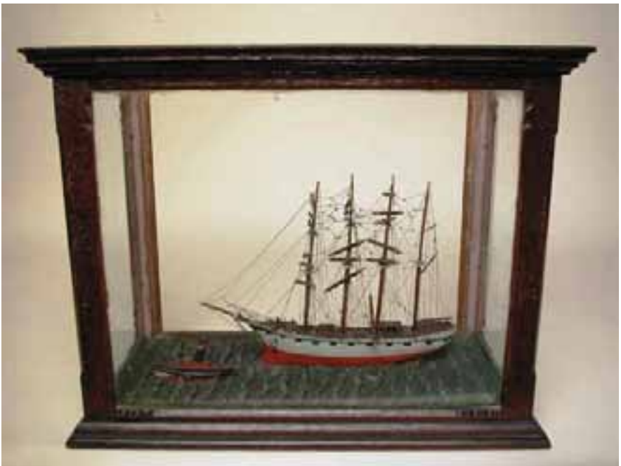
398. CASED MODEL OF THE SHIP EMMA, and steamer. Length of ship 9 ½ in. Case: Height 12 ¾ in. Width 16 ½ in. Depth 8 ½ in.