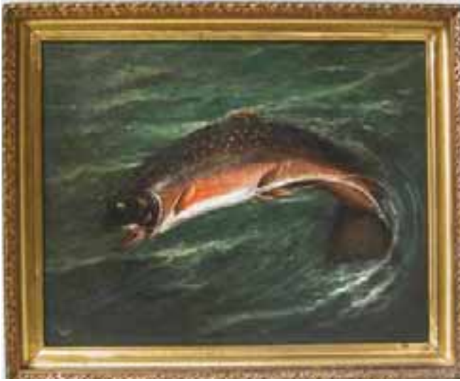
363. WILLIAM PLUMMER "Trout," 19 th Century, oil on canvas, brown trout on a fishing line in a stream, signed lower left W. Plummer. 15 in. x 19 in.