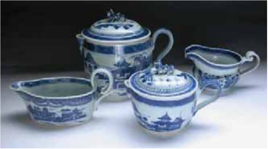
374. CHINESE EXPORT NANKING PORCELAIN CREAMER OR SAUCE BOAT, circa 1820, with unique applied 2 piece scroll handle. Length 7 ¼ in. Height 3 ½ in.