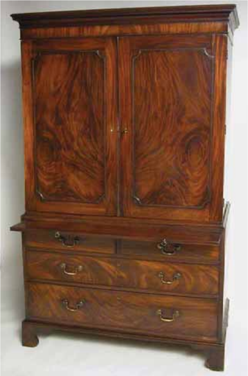
131. ENGLISH MAHOGANY LINEN PRESS, circa 1790 , in three sections: crown, two door upper section revealing four slide drawers, above two over two drawers and folding slide, on bracket feet. Height 79 in. Width 49 in. Depth 26 in.