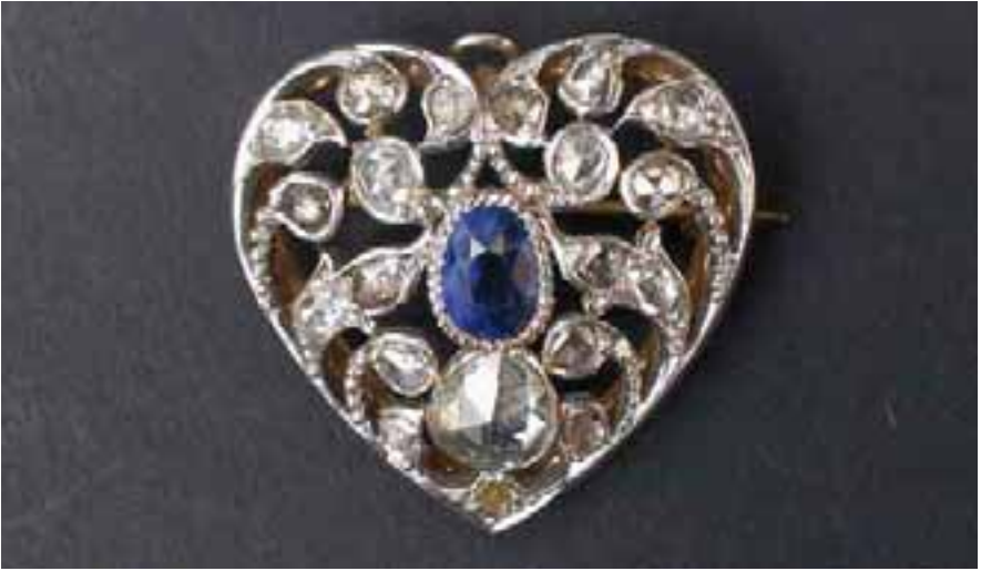
100. DIAMOND AND SAPPHIRE HEART PENDANT BROOCH , 20 antique cut diamonds and 1 sapphire set in platinum and yellow gold, 19 th Century.