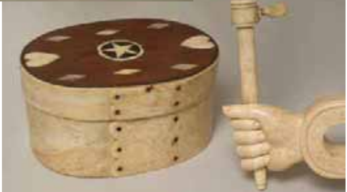
85B. AMERICAN WHALEBONE INLAID DITTY BOX, circa 1830, the body of oval form with scallop ended laps, the conforming wood top inlaid with whale ivory hearts, star in ring and diamonds, abalone diamonds and baleen trim. Height 2 ¾ in. Length 6 ½ in. Width 5 in.