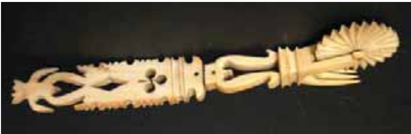
130. FINE PIERCED AND CARVED WHALE IVORY PIE CRIMPER, circa 1850, the grip with pierced clover, diamond and heart, joined with silver pins to fork and zigzag wheel with stylized lyre. Length 9 ½ in.