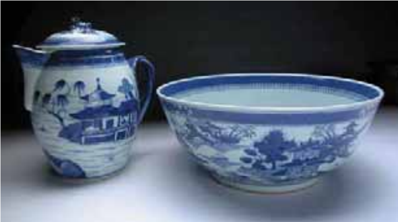
190. RARE LARGE CHINESE EXPORT CANTON PORCELAIN COVERED CIDER PITCHER, circa 1830, with two piece applied twisted handle and foo dog finial. Height 10 ½ in.