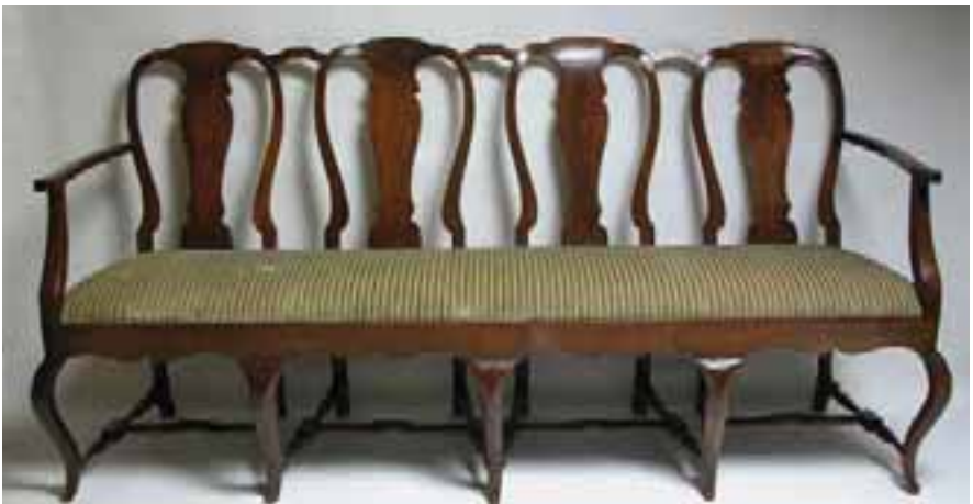
85. QUEEN ANNE QUADRUPLE BACK MAHOGANY SETTEE, 18 th Century , with slip seat, block and turned stretchers and cabriole legs. Length 73 in.