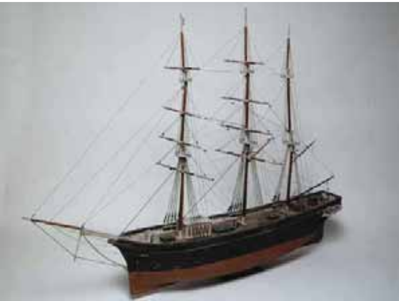
338. MODEL OF THE SHIP “DANIA” OF NEW YORK, M.P. Xanas July 27 1895. Height 72 in. Length 51 in. Width 19 in. The 4,076 ton ship Dania was built in 1889 and served the Hamburg America Line, which dealt mostly in immigrant travel from Germany to America. It was scrapped in Genoa in 1927.