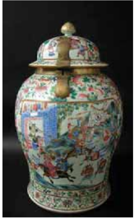
206. CHINESE PORCELAIN ROYAL PALACE RICE JAR, early 19 th Century, Famille Rose pattern with large panels depicting military engagements, brass mounted locking bands. Height 24 in.