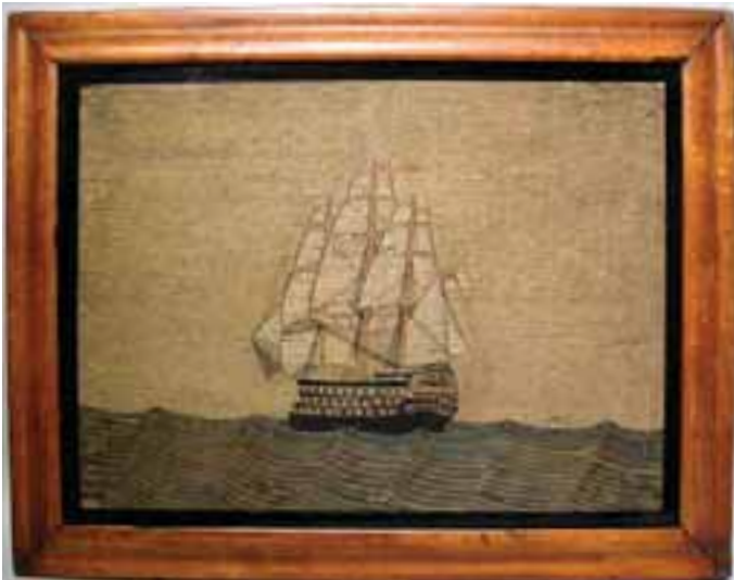
210. SAILOR MADE WOOLWORK EMBROIDERY OF THE THREE MASTED SHIP 19 th Century. 18 in. x 25 in.