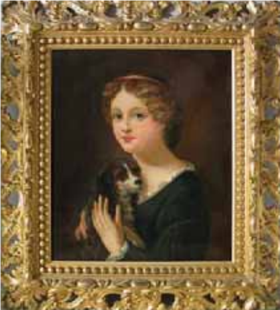
304. ENGLISH PORTRAIT OF A LADY WITH HER TERRIER, 19 th Century, oil on canvas. 20 ¼ in. x 17 ½ in.