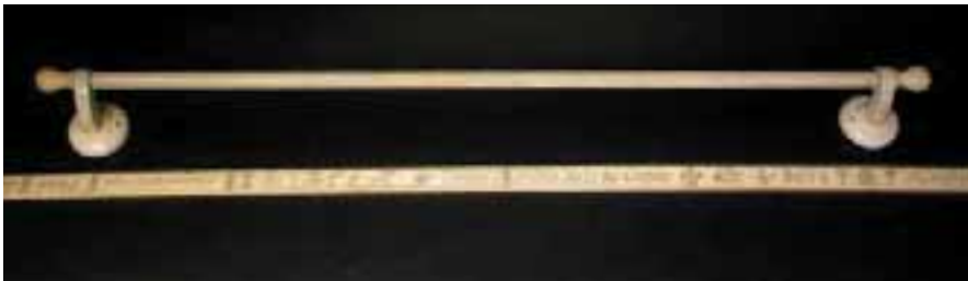
223. AMERICAN WHALEBONE AND WHALE IVORY TOWEL BAR, circa 1850, turned whale ivory knob ends with bone brackets and elephant ivory wall plates. Length 29 ½ in.