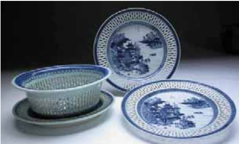
323. CHINESE EXPORT CANTON PORCELAIN CHESTNUT BASKET AND UNDERPLATE, 19 th Century. Basket Height 3 in. Width 8 ½ in. Underplate Width 8 ¾ in.