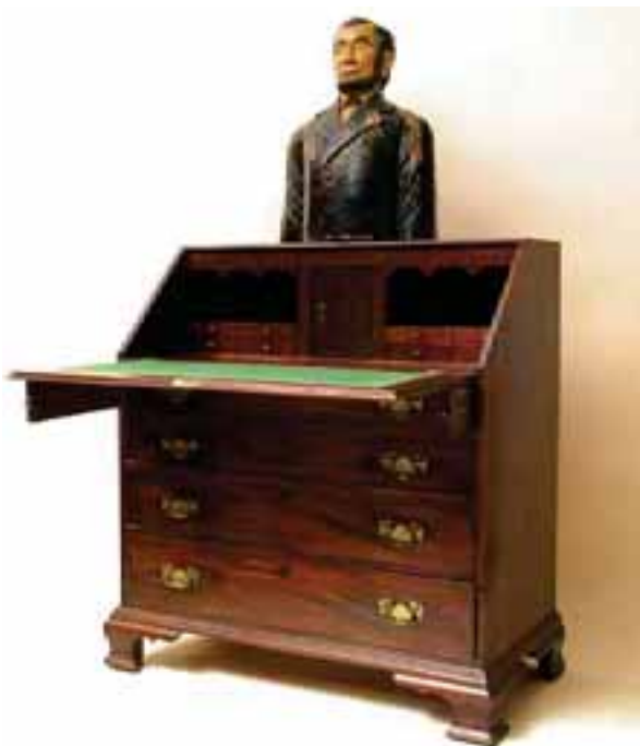
329. ENGLISH MAHOGANY SLANT FRONT DESK, circa 1790 , slant lid reveals elaborate fretwork carved interior over four graduating drawers on ogee bracket feet. Height 44 ½ in. Width 40 in. Depth 22 ½ in.