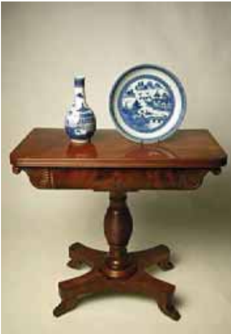
6. SCARCE CHINESE EXPORT CANTON PORCELAIN BOTTLE, circa 1820.