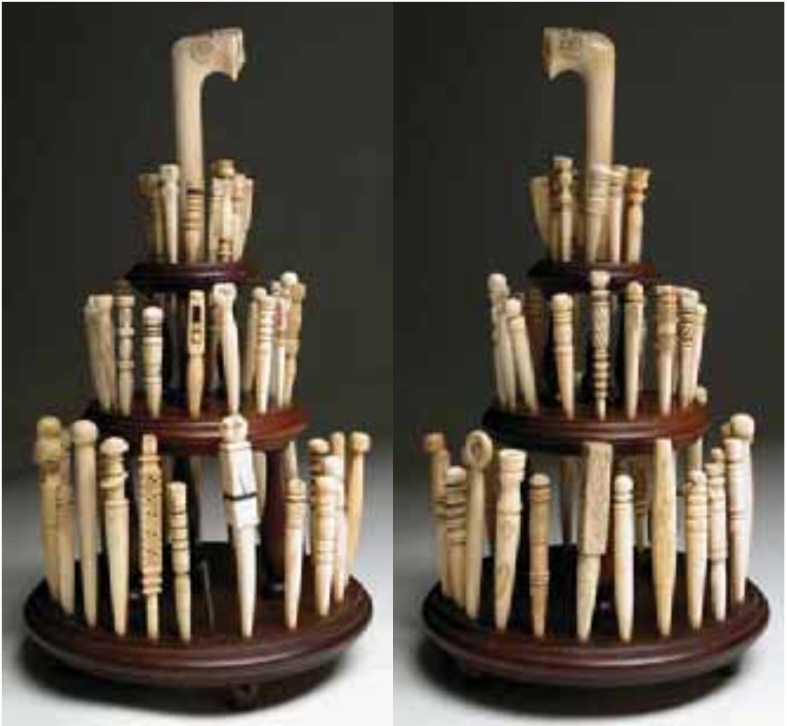
137. COLLECTION OF 60 CARVED, TURNED AND SCRIMSHAWED WHALE IVORY AND WHALEBONE BODKINS, circa 1830-1870 , displayed on a hand crafted three-tier carousel with a Victorian carved ivory parasol handle. Height 14 in.