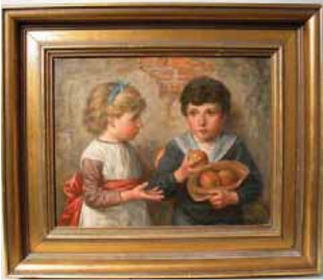
168. "TWO YOUTHS NEGOTIATING OVER AN APPLE", late 19 th Century, oil on canvas, signed lower right T.F.K. 12 in. x 15 in.