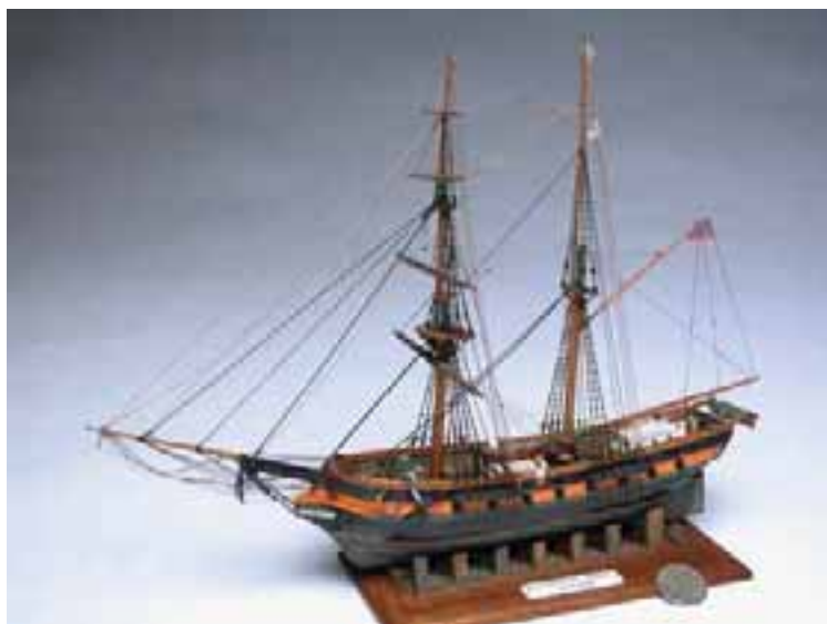
2. ANTIQUE MINIATURE CASED MODEL OF THE PRIVATEER " Cleopatra's Barge ," a US Navy ship in the War of 1812, from Salem, in domed glass case. Height 9 ½ in. Length 13 in.