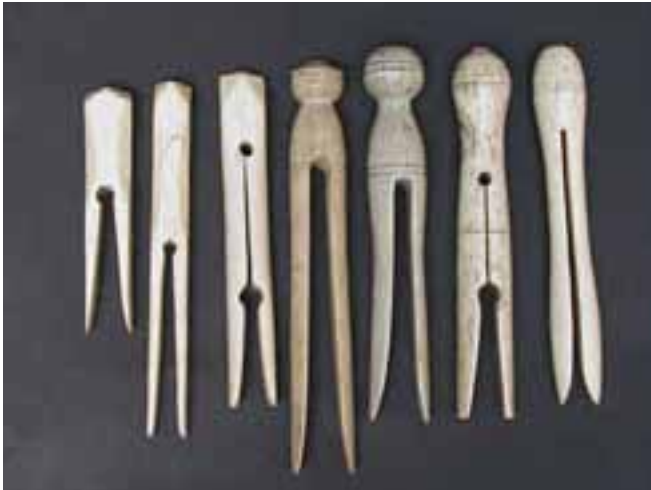
396. COLLECTION OF SEVEN CARVED AND TURNED WHALEBONE CLOTHESPINS, early to mid 19 th Century.