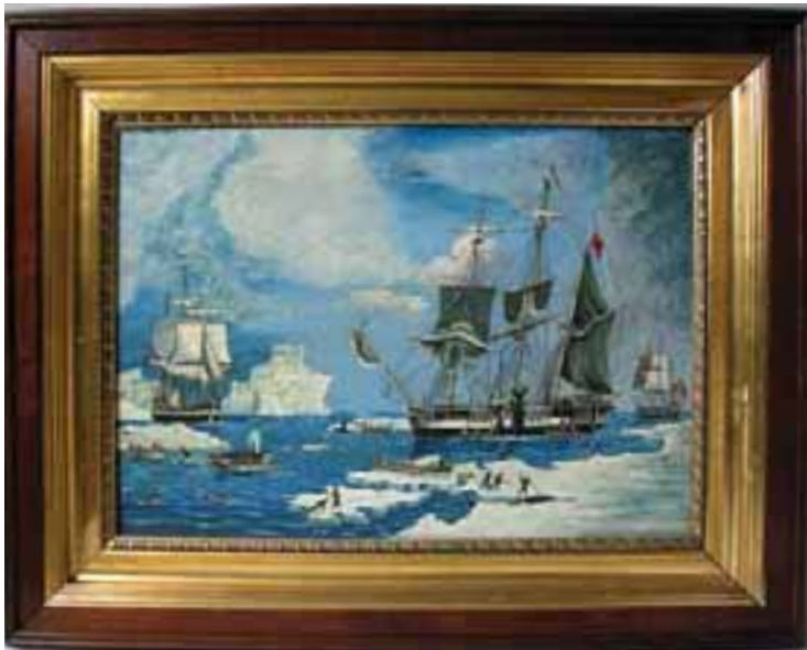
96. ANTARCTIC WHALING SCENE, oil on canvas, three British whale ships, 39 whale men, seven whales, three seals, two narwhal, and walrus in an icy setting; after the Huggins painting reproduced by lithographer Edward Duncan in 1827. 16 in. x 22 in.