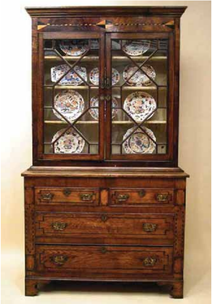
149. COLLECTION OF 10 IMARI IRONSTONE PLATES, 19 th Century.