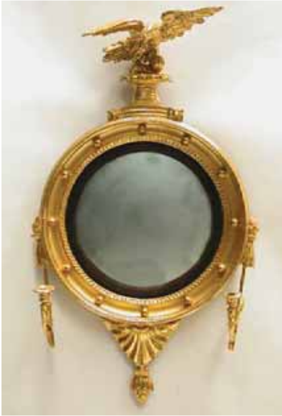
129. CARVED AND GILT CONVEX GIRANDOLE MIRROR, circa 1820. Height 41 in. Width 24 in.