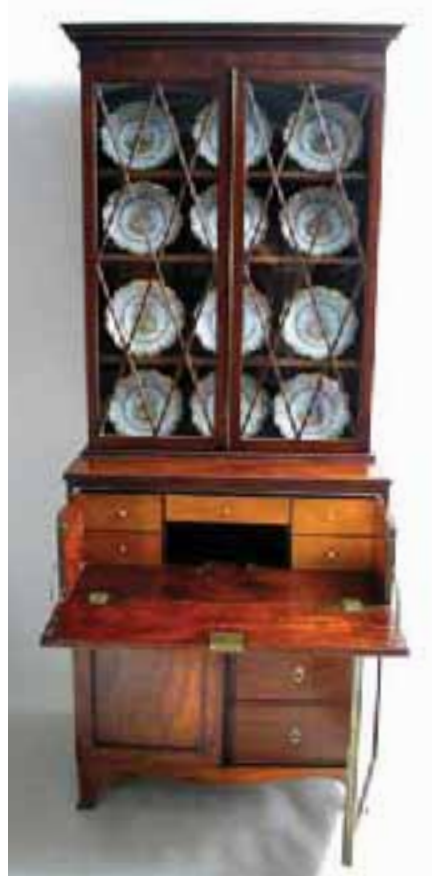
262. SET OF 12 DRESDEN HAND PAINTED AND PRINTED GILT SCALLOPED BORDER DESSERT PLATES , with floral decorations and courting scenes, retailed by The Ovington Brothers Company. Diameter 9 in.