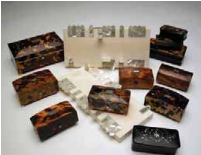
307. COLLECTION OF ELEVEN TORTOISE SHELL SNUFF OR STAMP BOXES, 18 th and 19 th Century.