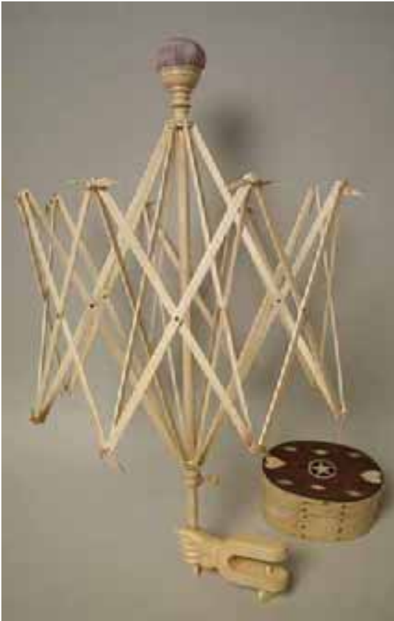
85A. WHALEBONE AND WHALE IVORY SWIFT, circa 1820, “C” clamp with finely carved hand holding swift shaft, carved from a single piece of whalebone. Simple single cage topped with turned ivory cup. Height 23 in.