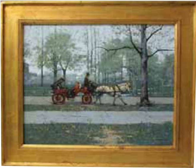
258. AY MACKINZIE "A Ride in the Park," oil on board, signed lower right Ay MacKinzie. 16 in. x 20 in.