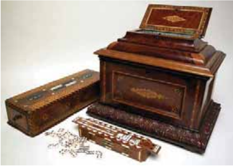
109. CRIBBAGE BOARD BOX, circa 1880 , inlaid with ebony, mahogany, satin, rosewood, mother of pearl, and ivory. Length 15 in.