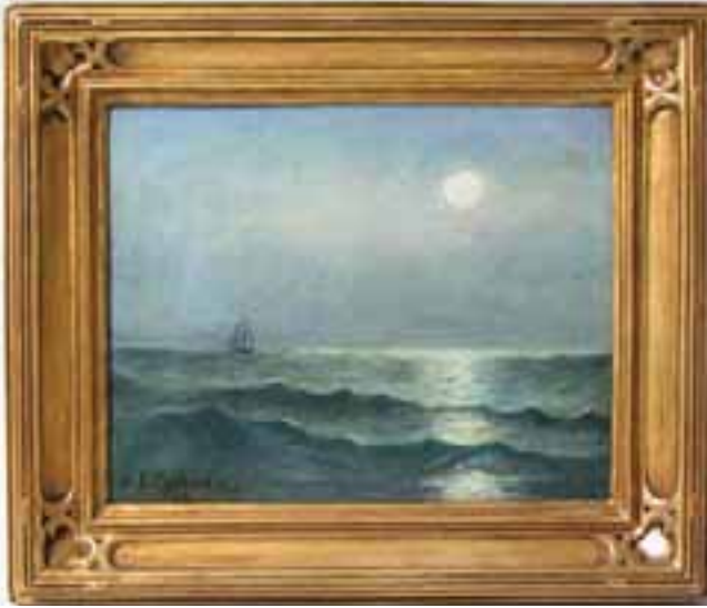
365. R.E. COCHRAN " Sunset Seascape ," oil on artist's board, signed lower left, R.E. Cochran, 1906. 7 ½ in. x 9 ½ in.