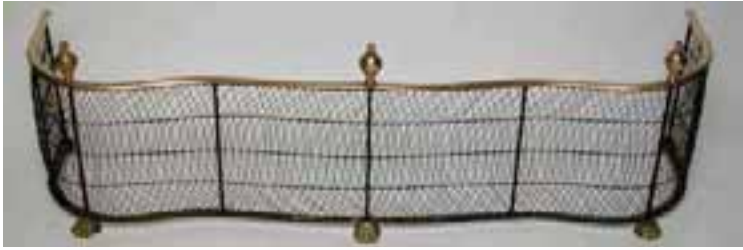
248. SERPENTINE BRASS AND WIRE FIREPLACE FENDER, 18 th Century, three finials above a brass rail conforming a wire fender on brass paw feet. Length 50 in.