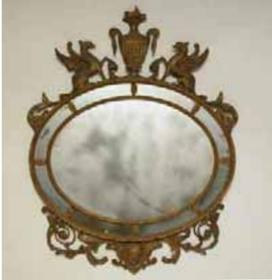
269. GREEK REVIVAL CARVED AND GILT MIRROR, 19 th Century. 43 ½ in. x 33 ¼ in.