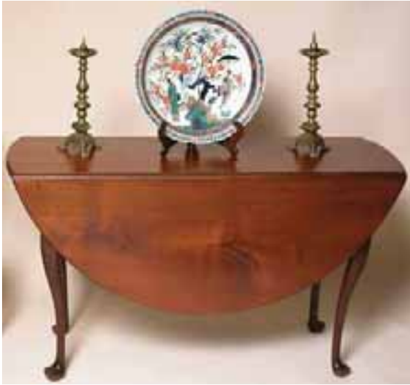
278. QUEEN ANNE MAHOGANY DROP LEAF DINING TABLE, 18 th Century. Height 28 ½ in. Width 49 in. Depth 18 in.