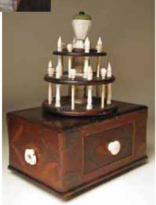
78. SAILOR MADE WHALE IVORY AND WHALEBONE INLAID SEWING BOX, circa 1850, two-tier swivel spool carousel with pincushion cup and one drawer inlaid box with ivory handles. Height 11 ½ in. Width 8 ½ in. Depth 6 in.