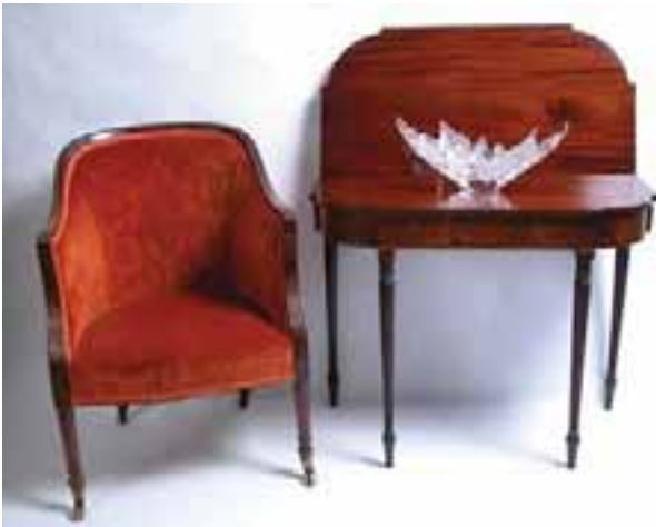
245. FEDERAL MAHOGANY UPHOLSTERED TUB CHAIR, circa 1800, turned legs ending in brass casters.