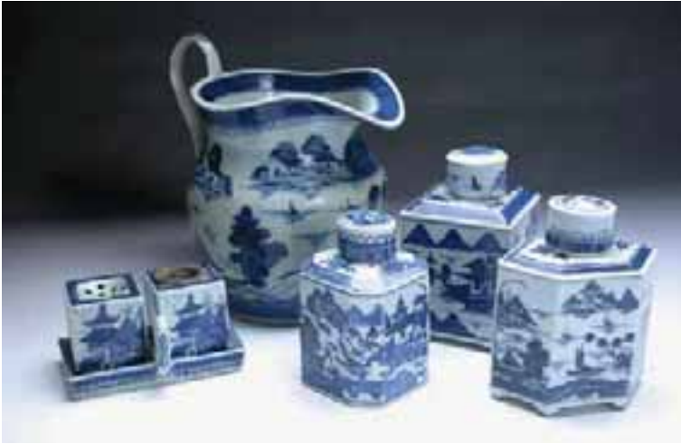
187. RARE CHINESE EXPORT CANTON PORCELAIN INK STAND, circa 1820.