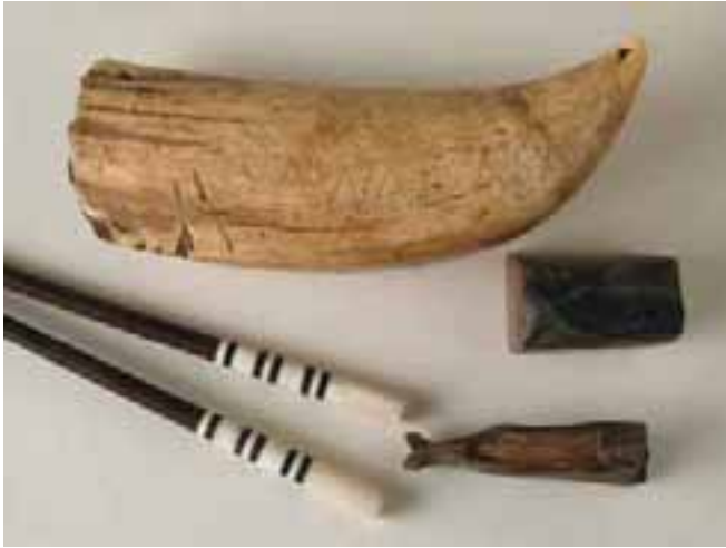
392. TAMBUA WHALE TOOTH, circa 1830, engraved "SAWAKASA." Length 6 ½ in.