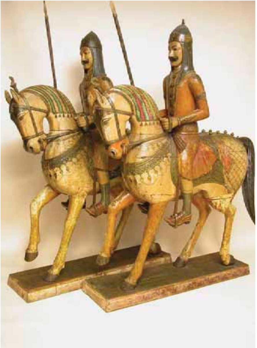
201. PAIR OF INDIAN HAND CARVED AND PAINTED TEMPLE GUARDIANS ON HORSEBACK, turn of the Century. Height 80 in. Length 62 in.