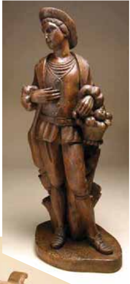
284. FRENCH CARVED FIGURE OF A YOUNG FRUIT VENDOR, circa 1870 , carved of a single section of oak, the figure holding a basket of fruit. Height 46 in.