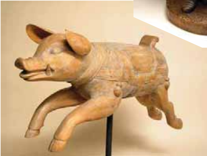
285. FOLK ART CARVED PIG CAROUSEL FIGURE, turn of the Century , in natural finish. Length 52 in. Provenance: Lindeman Collection, Seattle to present owner.