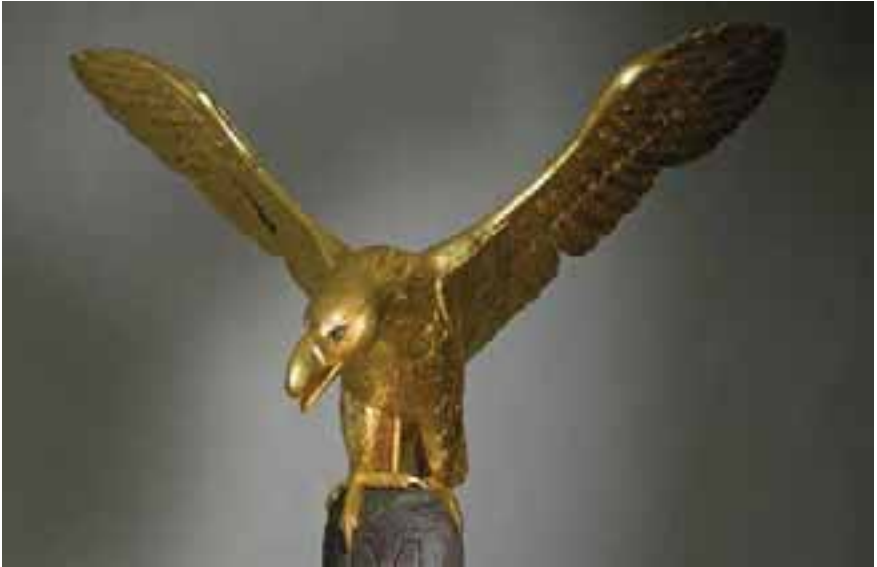
335. AMERICAN CARVED AND GILT PILOT HOUSE EAGLE, circa 1860, perched on a rock formation. Height 32 in. Width 44 in.