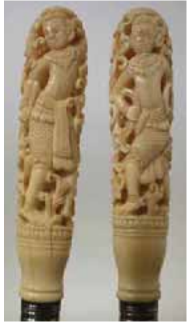
282. SET OF 12 CHINESE EXPORT CARVED IVORY HANDLE KNIVES AND FORKS, circa 1850 , two full figures on each handle amongst foliate scrolls in a fitted to tray mahogany box.