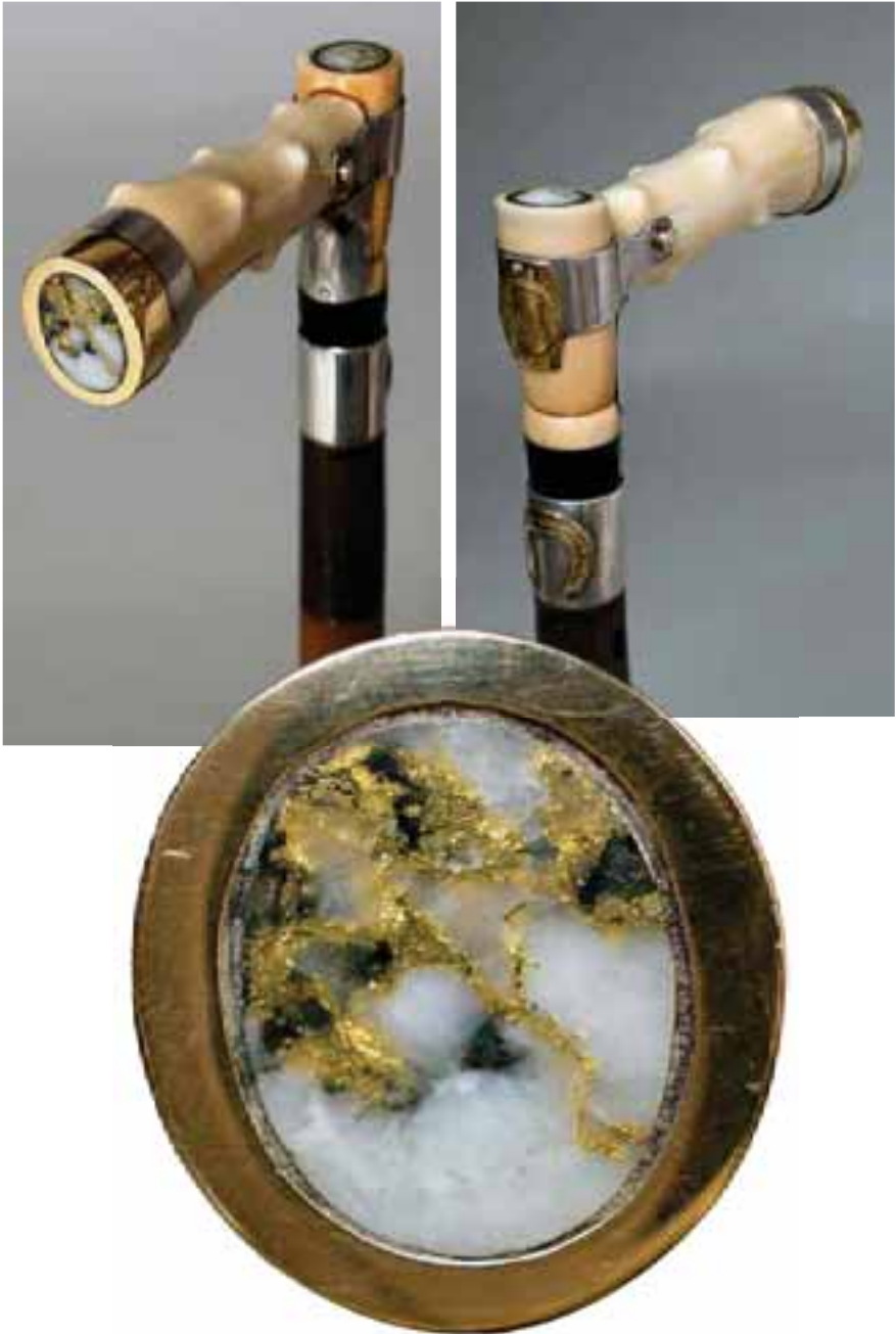
286. RARE “GOLD RUSH” GOLD QUARTZ WALKING STICK, circa 1848-1855, with two gold quartz medallions, gold bands, gold horseshoe, sterling silver, ebony, ivory and leather on wood shaft.