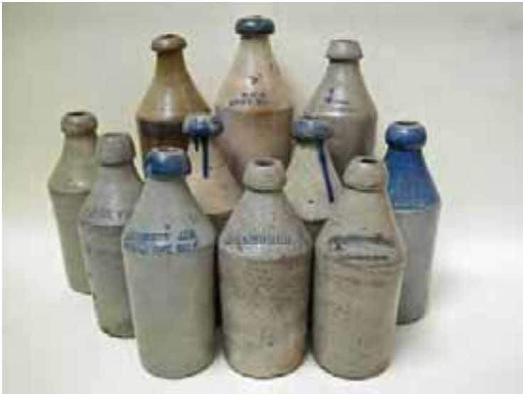
421. GROUP OF 11 AMERICAN COBALT DECORATED STONWARE BEER AND SODA BOTTLES, mid 19 th Century , comprising: “Pentucket Ale Bottle Not Sold,” “Scott’s Cream Beer,” “HR Prentice 1871,” “Smith’s White Root Pa’d July 1766,” “H.W.H. Root Beer,” “D. Cambell 1873,” “Sarsparilla Stacey & Speed,” “M. White,” “J. Devine” (as is), and 2 unmarked bottles. Height 9.5 - 11 in.