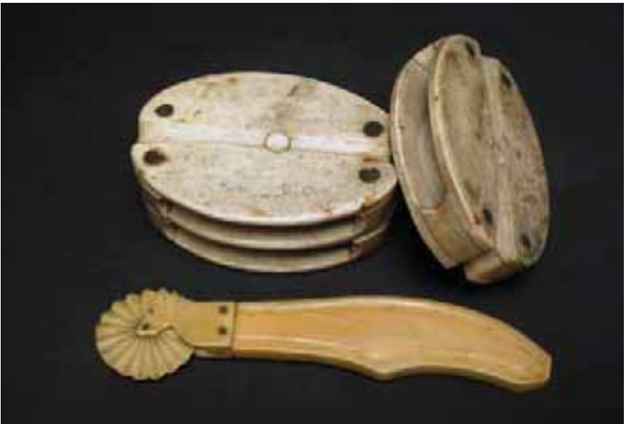
156. TWO CARVED WHALEBONE SHIP'S BLOCKS, circa 1830 , a single and a double block with bone sheaves. Length 3 ½ in. each