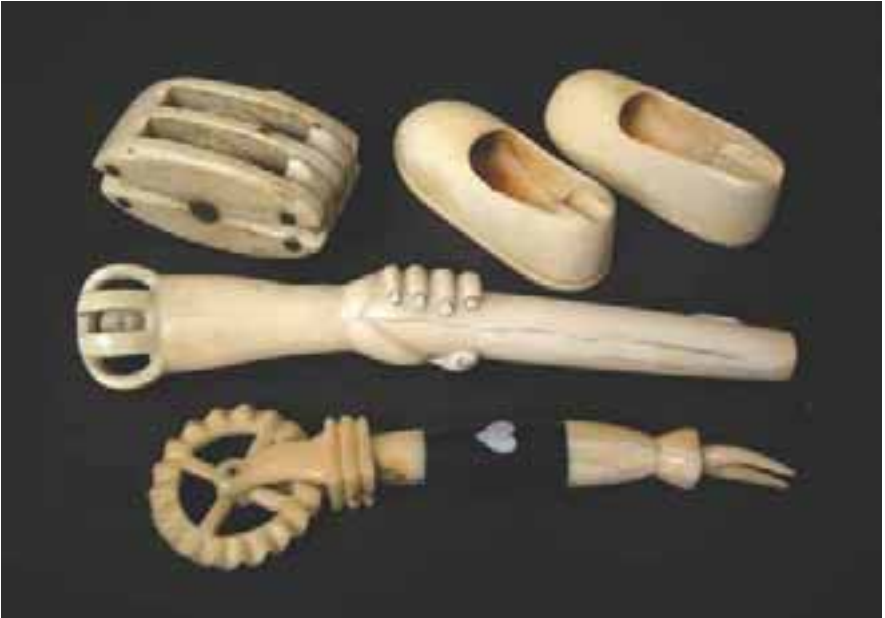
158. WHALE IVORY DOUBLE BLOCK, circa 1830 , carved out from a single whale's tooth, copper pins and ivory sheaves. Length 2 ½ in.