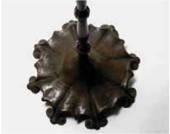
271. TIFFANY STUDIOS GREEN PATINA COUNTER BALANCE FLOOR LAMP with ratchet bulb socket on eight scrolled feet base, stamped on the underneath of base " Tiffany Studios New York #619. " Height 50 in.