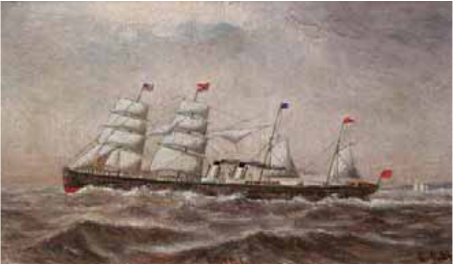
99. OIL ON CANVAS BOARD " Portrait of the Four-Masted Steam Sail 'Egypt,' " signed lower right C.D.M., 1883 and titled lower center ' Egypt ', in original gilt frame. The ship Egypt built 1871, Liverpool England, 4670 tons. 4 in. x 7 in.