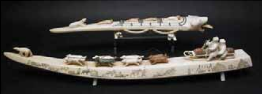
154. LEO KUNNACK CARVED AND SCRIMSHAWED WALRUS TUSK CRIBBAGE BOARD, circa 1910 , carved bear's head on one end with removable tongue for peg storage, mounted with four seals followed by a bear, the board supported by two full bodied seals. Length 18 ½ in.