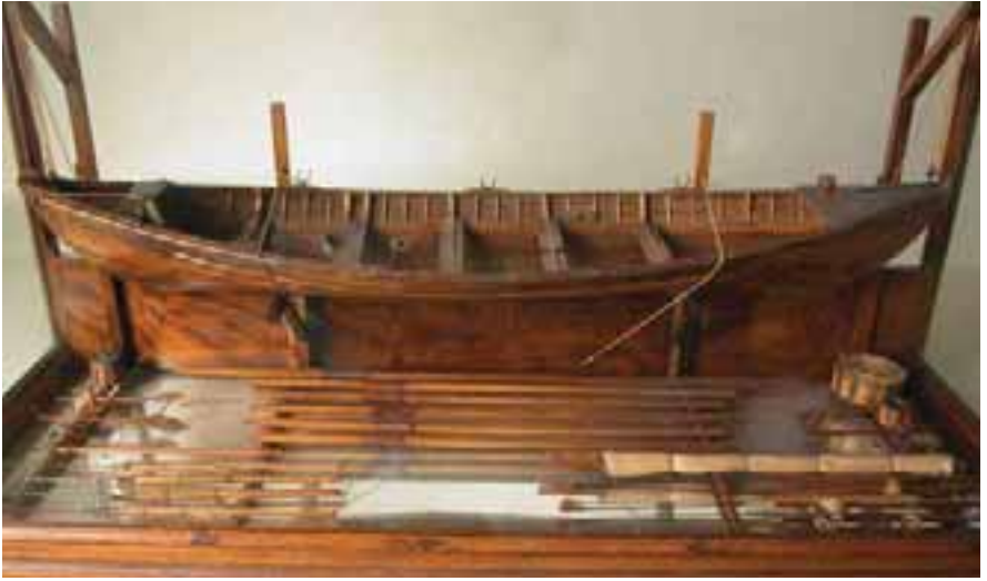
79. CASED MODEL OF A NANTUCKET LONG BOAT, circa 1920 , scale wood model on davits with all 32 whaling accoutrements organized on ground. Height 13 in. Length 24 ½ in. Depth 9 ¾ in.