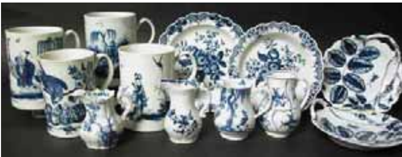
232. COLLECTION OF BLUE AND WHITE ROYAL WORCESTER PORCELAIN, 18 th Century, comprising: 4 mugs, 4 miniature bulbous creamers, 2 scalloped edge plates, and a pair of leaf trays.