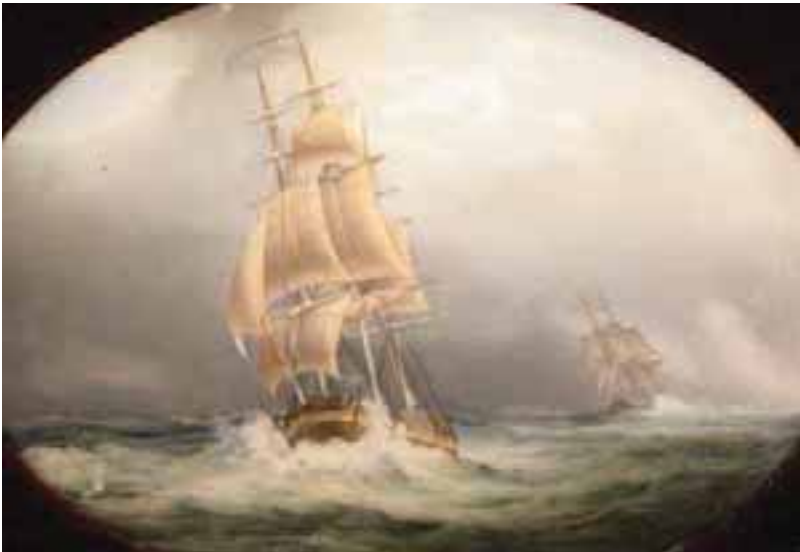
334. MINIATURE OIL ON PORCELAIN "Clipper on the Open Sea," circa 1830 , signed and dated on reverse "L.R. L_gbye, 1830." 5 ½ in. x 4 in.