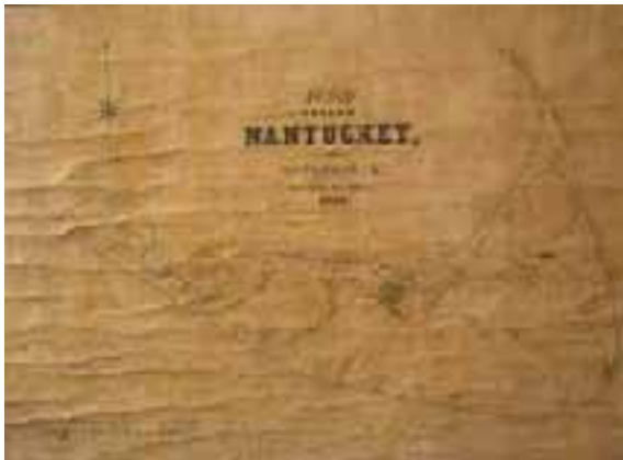
4. “Map of the Island of Nantucket, Including Tuckernuck, Surveyed by Wm. Mitchell, 1838,” Published by E.W. Bouvé’s Drawing and Lithography, Graphic Court, Boston”. 24 ½ in. x 35 in.