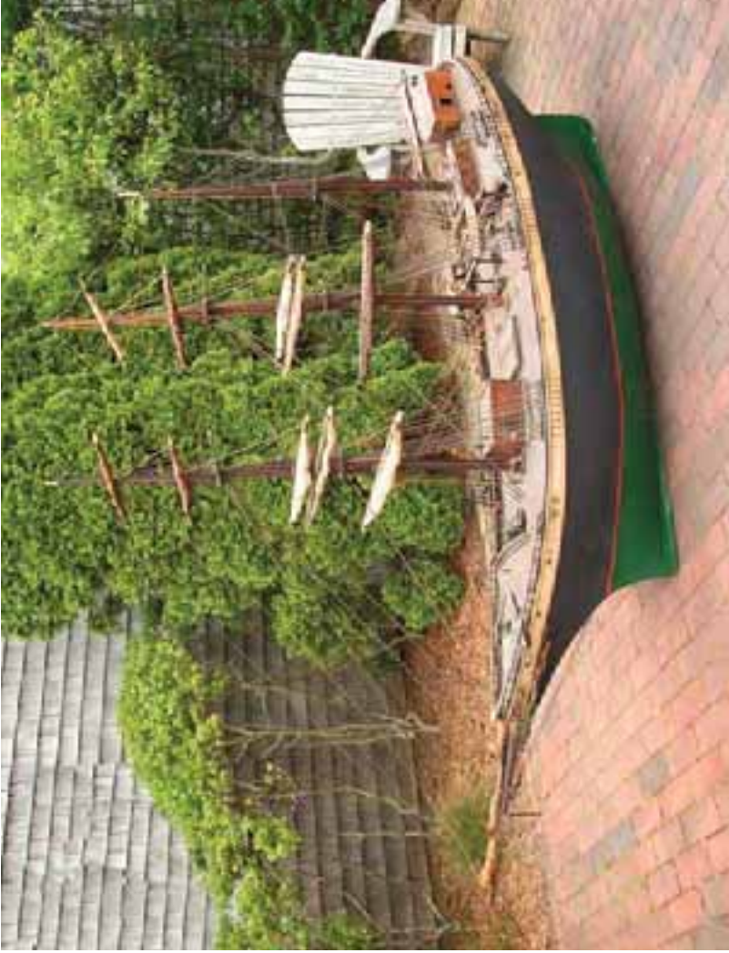
177. LARGE SHIP MODEL OF THE THREE-MASTED SQUARE RIGGED "Mafaldo." This ship model decorated the dining room of the Harbor House Restaurant for a number of years. Height 70 in. Length 70 in. Widest Point 24 in.