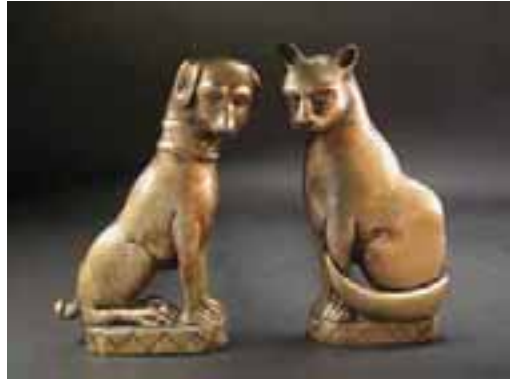
63. PAIR OF BRASS CAT AND DOG ANDIRONS, circa 1900 , each seated on offset plinth, dog with “DAM” name collar. Height 9 ½ in.