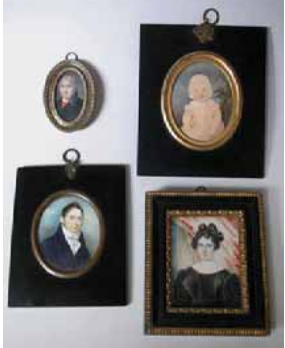
305. FOUR ENGLISH MINIATURE PORTRAITS, 18 th Century oval portrait on ivory of a gent, 2 in. 19 th Century oval portrait on ivory of a gent, 2 ¾ in. Watercolor portrait of a baby girl, 2 ¾ in. Oval portrait on ivory of a young lady by a window with drapes, 3 in. x 2 ¼ in.