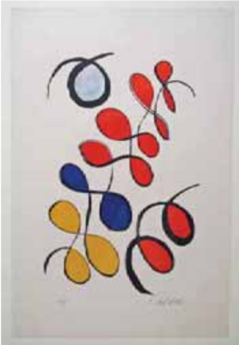
254. ALEXANDER CALDER (CONNECTICUT/ NEW YORK 1898-1976) LITHOGRAPH, "Boules de Couleurs," limited edition #44/75, signed in pencil lower right, Calder. 30 in. x 20 ½ in.

Alexander Calder was born in Pennsylvania to a family of artists and pursued a degree in mechanical engineering from the Stevens Institute of Technology, before turning to art. He moved to Paris in 1926 and was influenced by avant-garde artists there including Piet Mondrian, le Corbusier, Joan Miró, and Man Ray. Calder is credited with the invention of the mobile and explores movement in both his sculpture and paintings. His works can be found in the Art Institute of Chicago, the Guggenheim Museum –New York, the Museum of Modern Art, the National Gallery –Washington DC, the Tate Gallery –London, and the Museum of Contemporary Art – Barcelona, to name a few.