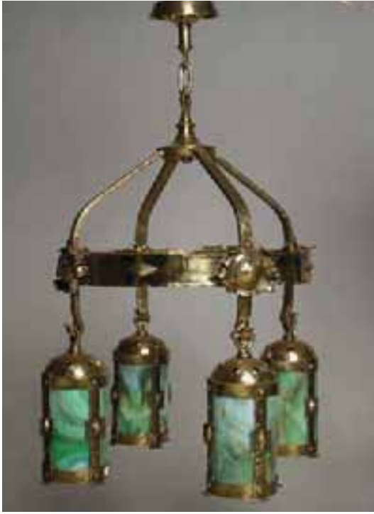
97. ARTS AND CRAFTS POLISHED BRONZE AND GREEN GLASS FOUR-LIGHT CHANDELIER , with 4 matching wall sconces. Height 41 in. Diameter 24 in.