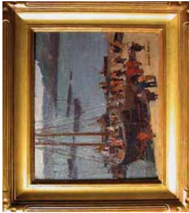
214. EDGAR A. PAYNE (CALIFORNIA 1883-1947) oil on panel, circa 1923, signed lower right Edgar Payne. 13 x 15 ½ in. Provenance: Vallejo Gallery, Newport Beach to present owner.

Edgar Payne, one of the foremost plein-air landscape painters of California during the early 20 th Century, is known for his majestic Sierra Nevada Mountain scenes, but painted in many other locations including the coast of Laguna Beach, the Canadian Rockies, the French and Swiss Alps, the Italian and French Riviera and the small fishing villages of Concarneau and Douarnenez on the Brittany Coast. A unique view of a crowded quay (an abundance of figures is rare in the majority of Payne's work); with fishermen offloading the day's catch as evening approaches. Broad brush strokes, using bristle rather than sable brushes and skill with a palette knife, gives this work a subtle distinction and structure.