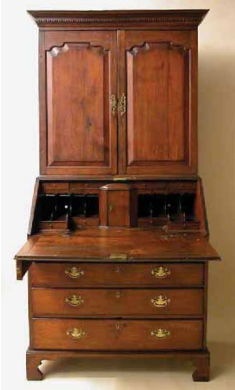
81. CHESTER COUNTY, PENNSYLVANIA WALNUT SECRETARY BOOKCASE, mid 18 th Century , in two sections, the upper with dental molding and paneled doors above a slant lid desk compartment with concealed drawers, pigeon holes and central door, above graduating drawers on bracket feet. Height 84 in. Width 40 in. Depth 23 in.