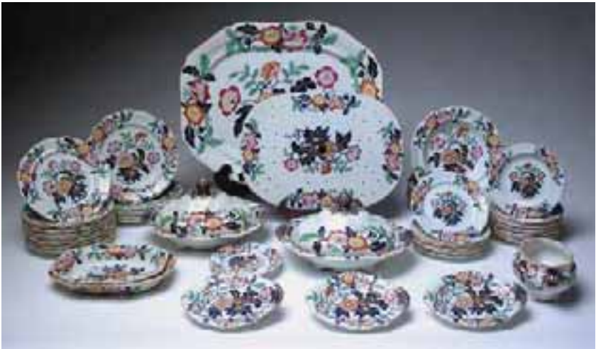
234. DECORATED MASON'S IRONSTONE CHINA PARTIAL DINNER SERVICE, 19 th Century , 21" meat platter with drip pan, 2 covered tureens, sauce tureen, 3 spoon rests, 2 rectangular open vegetable bowls, 6 (10") plates, 7 soup bowls, 12 (8 1/2") plates, 8 (7") plates, 11 (7") shallow bowls, and 3 (6 1/4") plates.