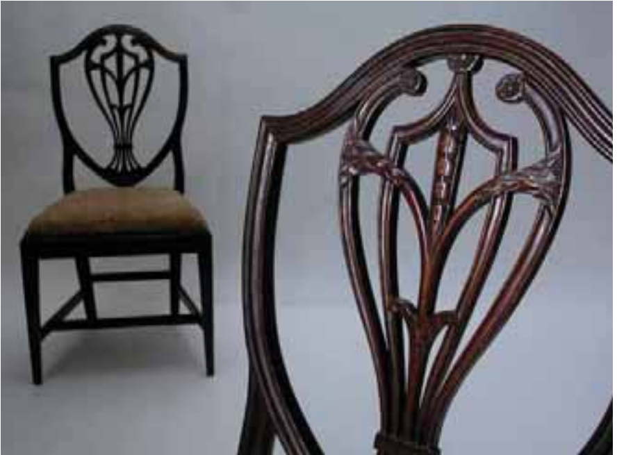
233. PAIR OF AMERICAN CARVED MAHOGANY SHIELD BACK SIDE CHAIRS, 18 th Century , pierced splat with rosettes, leaves, branches, and scrolls within a reeded shield.