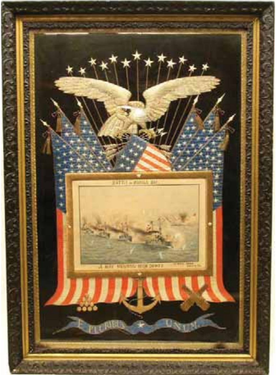
118. SILK, GOLD AND SILVER THREAD EMBROIDERY “Great White Fleet,” circa 1898 , commemorating the “Battle of Manila Bay, A May Morning with Dewey, 1 st May 1898 Cavite P.I.” with flags, eagle, anchor, and crossed cannons on silk ground in original frame. 55 in. x 39 in.