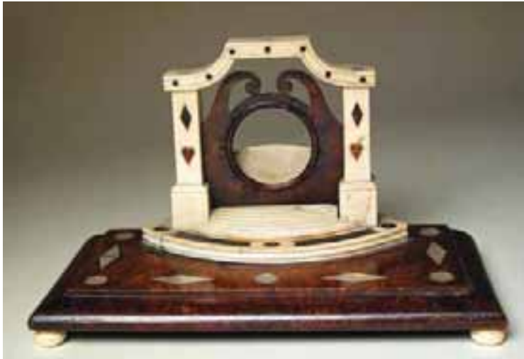
151. SAILOR MADE WATCH HOLDER, circa 1830 , assembled with whale ivory, mother of pearl, tortoise, silver and burl wood. Height 5 ¼ in. Width 9 ¼ in. Depth 4 ¼ in.