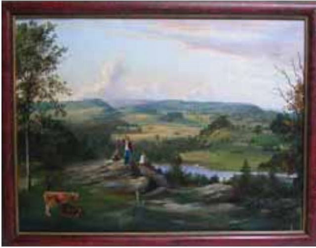
9. NEW ENGLAND SCHOOL "Mountain River Landscape," 19 th Century, oil on canvas with view of mountains, river, farmland and figures in foreground, in period paint decorated frame. 30 in. x 40 in.