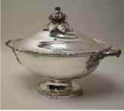
260. FRENCH SILVER SOUP TUREEN AND COVER, PARIS, circa 1850 , plain oval with gadrooned lid interrupted by shell and scroll motifs; dome cover with pomegranate finial, on conforming foot, similarly decorated, handles applied to body by large leaves. Height 11 in. Length 15 ¾ in.