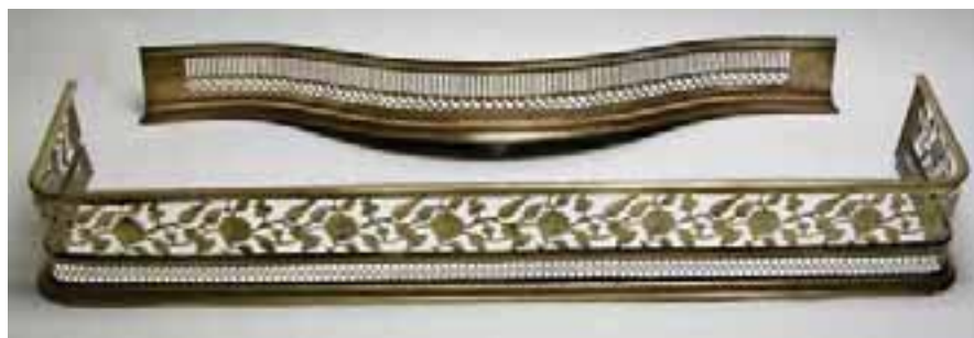
39A. FINE ENGLISH BRASS SERPENTINE FIREPLACE FENDER, circa 1750-70, cut ocean waves and four layers of applications. Length 43 ½ in.