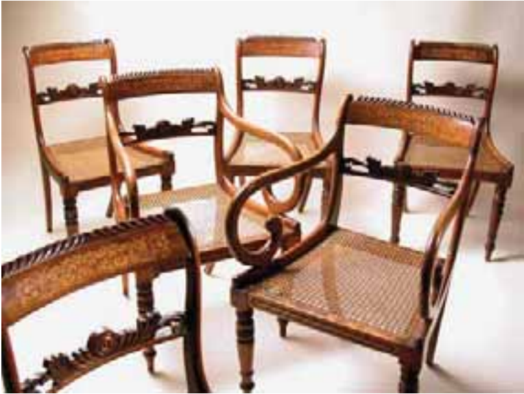
306. SET OF SIX REGENCY FAUX ROSEWOOD DECORATED INLAID DINING CHAIRS, circa 1820, gadroon and maple inlaid crest rail above a leaf carved rail, caned seats and turned front legs.