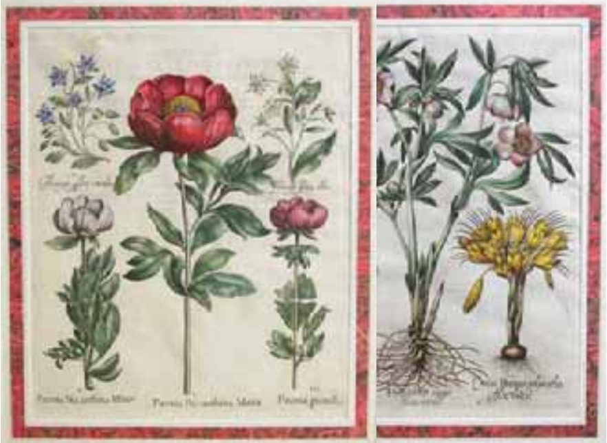
302. PAIR OF BASILIUS BESLER (GERMAN 1561-1629) HAND COLORED COPPER ENGRAVINGS OF FLOWER SPECIES , from Hortus Eystettensis , 1613. 19 ½ in. x 16 ½ in.