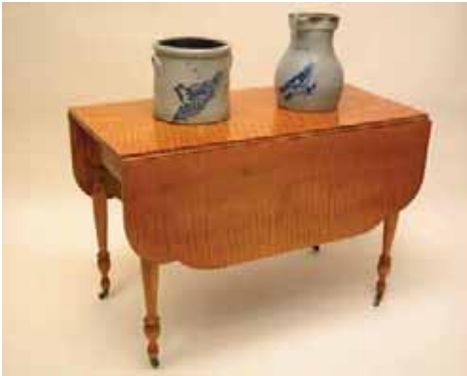
27. AMERICAN COBALT BLUE DECORATED STONEWARE 2-GALLON JAR CROCK, mid 19 th Century, with stylized bird and branch decoration, stamped "F.B. Norton & Sons, Worcester, Mass." Height 9 in.