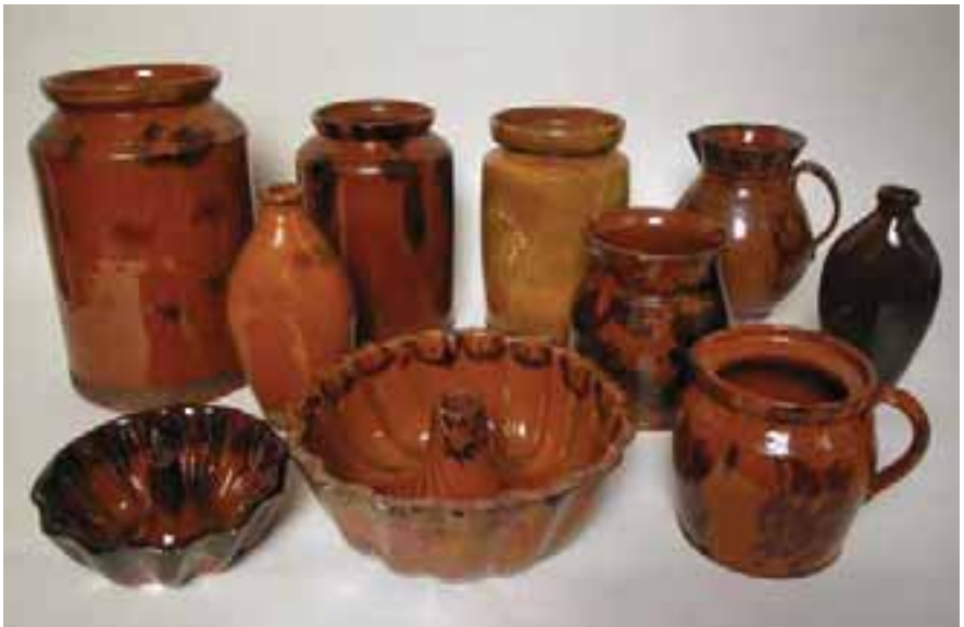
419. COLLECTION OF AMERICAN REDWARE, 19 th Century, 4 jars, 2 pitchers, 2 cake molds, and 2 flasks.