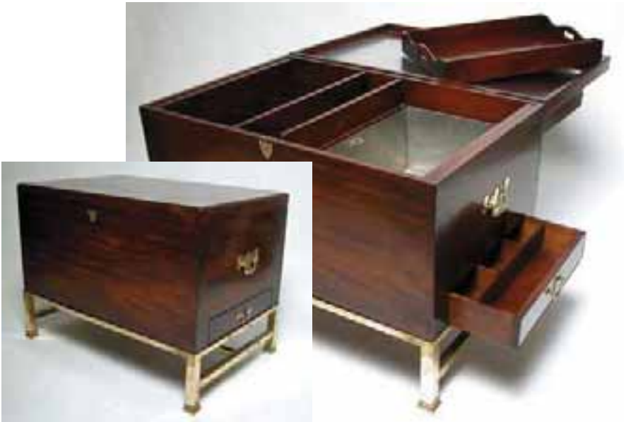
239. MAHOGANY AND BRASS CELLARETTE , rectangular dovetailed box with brass batwing handles, pullout cutting board, five compartment drawer on a brass square frame, the tin lined interior fitted with eight bottle slots and removable mahogany tray. Height 26 in. Width 34 ½ in. Depth 23 in.