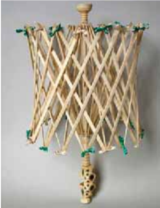
209. WHALE IVORY, WHALEBONE AND ABALONE SWIFT, circa 1830, faceted abalone inlaid ivory clamp, turned rings and cup, whalebone shaft and ribs. Height 22 in.