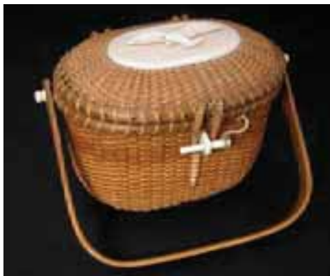
140. SHERWIN BOYER NANTUCKET COCKTAIL BASKET with carved ivory spread wing seagull on ivory top, original paper label and stamp upon the base. Paper label I was made on Nantucket, I am strong and stout, don't lose me or burn me, I'll never wear out, made by S.P. Boyer. "