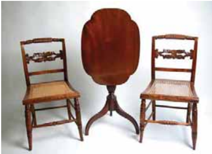
75. PAIR OF AMERICAN FEDERAL TIGER MAPLE CARVED CANE SEAT SIDE CHAIRS, 19 th Century, turned crest rail over carved leaf rail with rectangular cane seats.