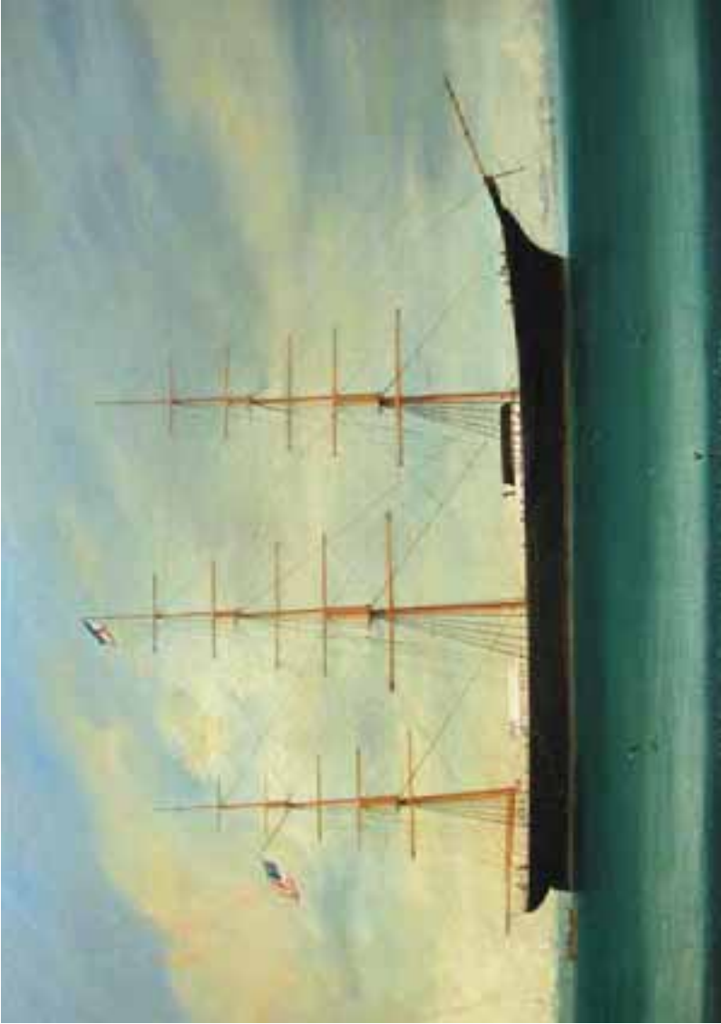
178. CHINA TRADE SHIP PORTRAIT "Ship 'City of Boston' Laying at Anchor in Yokohama, Japan," 19 th Century, oil on canvas. 20 in. x 28 ½ in.